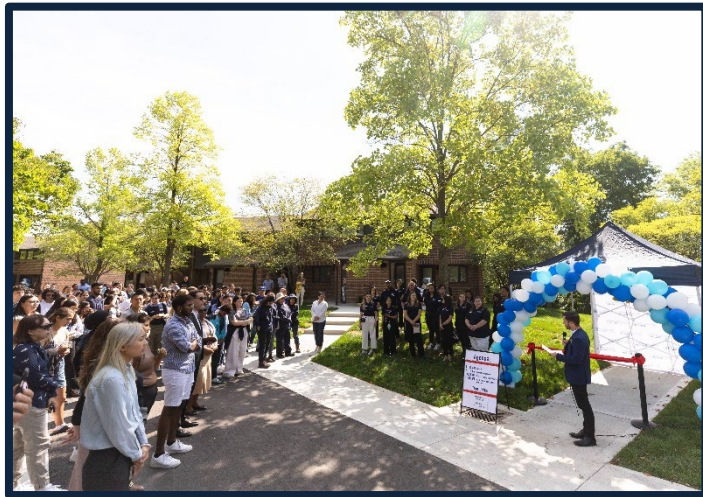
Leacock Lane Grand Re-Opening Event August 2023