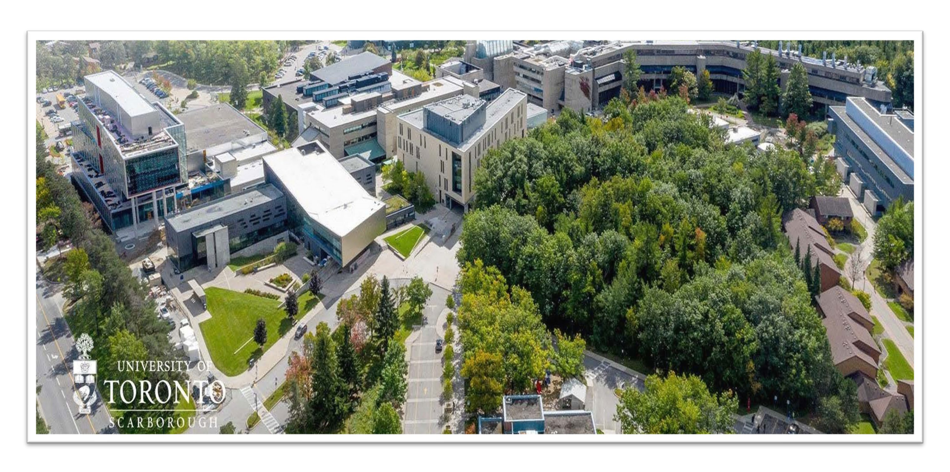
UTSC Capital Projects Construction Report - March 31, 2024