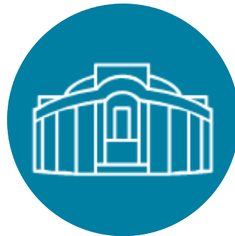
Space and Environment