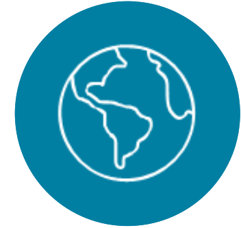
Equity, Diversity, Inclusion and Indigeneity