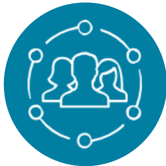
Programs and Services