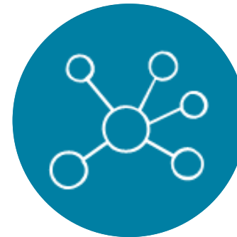
Systems and Technology