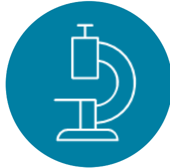
Assessment and Application of Research and Theory