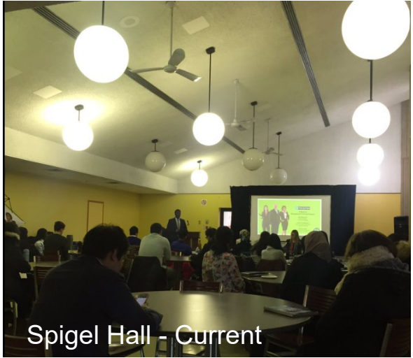
Spigel Hall - Current