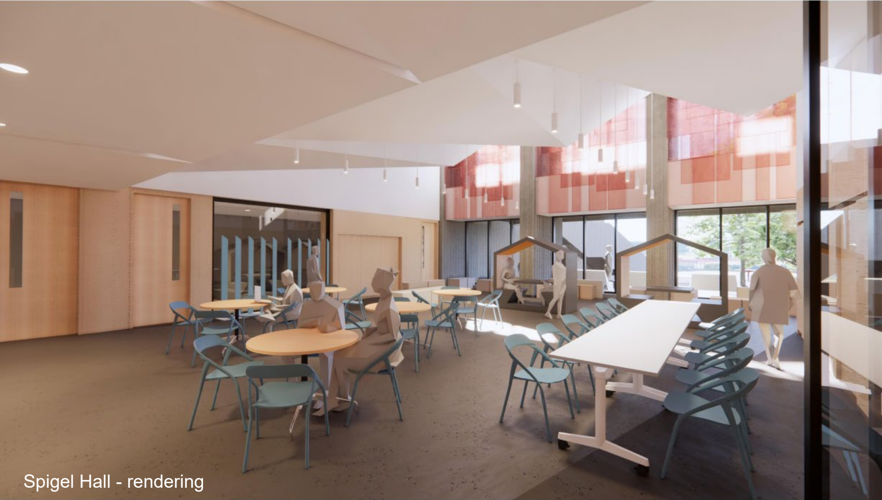
Spigel Hall - rendering