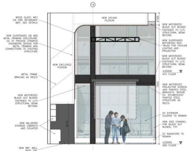
2 PROPOSED - EAST ELEVATION/SECTION ROOM CC 3000 A3.1 1:50