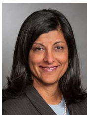
Zabeen Hirji Government Appointee