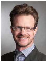
Mark Henry Rowswell Government Appointee