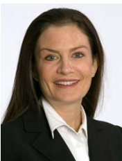
Melinda Rogers Government Appointee