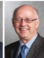
William A. Gough Teaching Staff