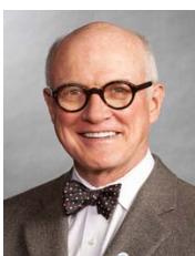
W. John Switzer Alumni