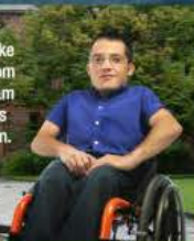
Part-Time Students, Full-Time Debt

A part-time course load makes higher education a possibility for a student like me with a disability. Being blocked from the Ontario Student Assistance Program because I am a part-time student feels like just another form of discrimination.