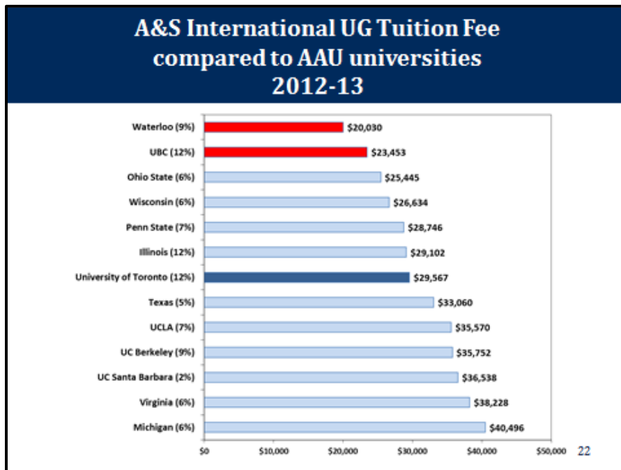
Figure 3: International tuition fee for Arts & Science at the University of Toronto, relative to some AAU peers, for 2012-13.

International tuition fees at the University of Toronto remain competitive with peer institutions. Once again, a comparison of the Arts and Science undergraduate tuition is a useful example. Arts and Science international undergraduate tuition (plus incidental fees) at the University of Toronto ($29,567) is at the top of the range of our U15 peers. This is appropriate given the University of Toronto's place in the international rankings. Tuition plus fees for undergraduate out-of-state Arts and Science students for the AAU public universities in the United States ranged last year from $18,609 to $40,496 US, with a mean of $28,653. Private institutions' fees remain considerably higher at $37,500 to $43,200. Applications from international students across all programs remain very strong, and in fact are increasing each year. Figure 3 displays the international tuition fee for Arts & Science at the University of Toronto, relative to some AAU peers, for 2012-13.