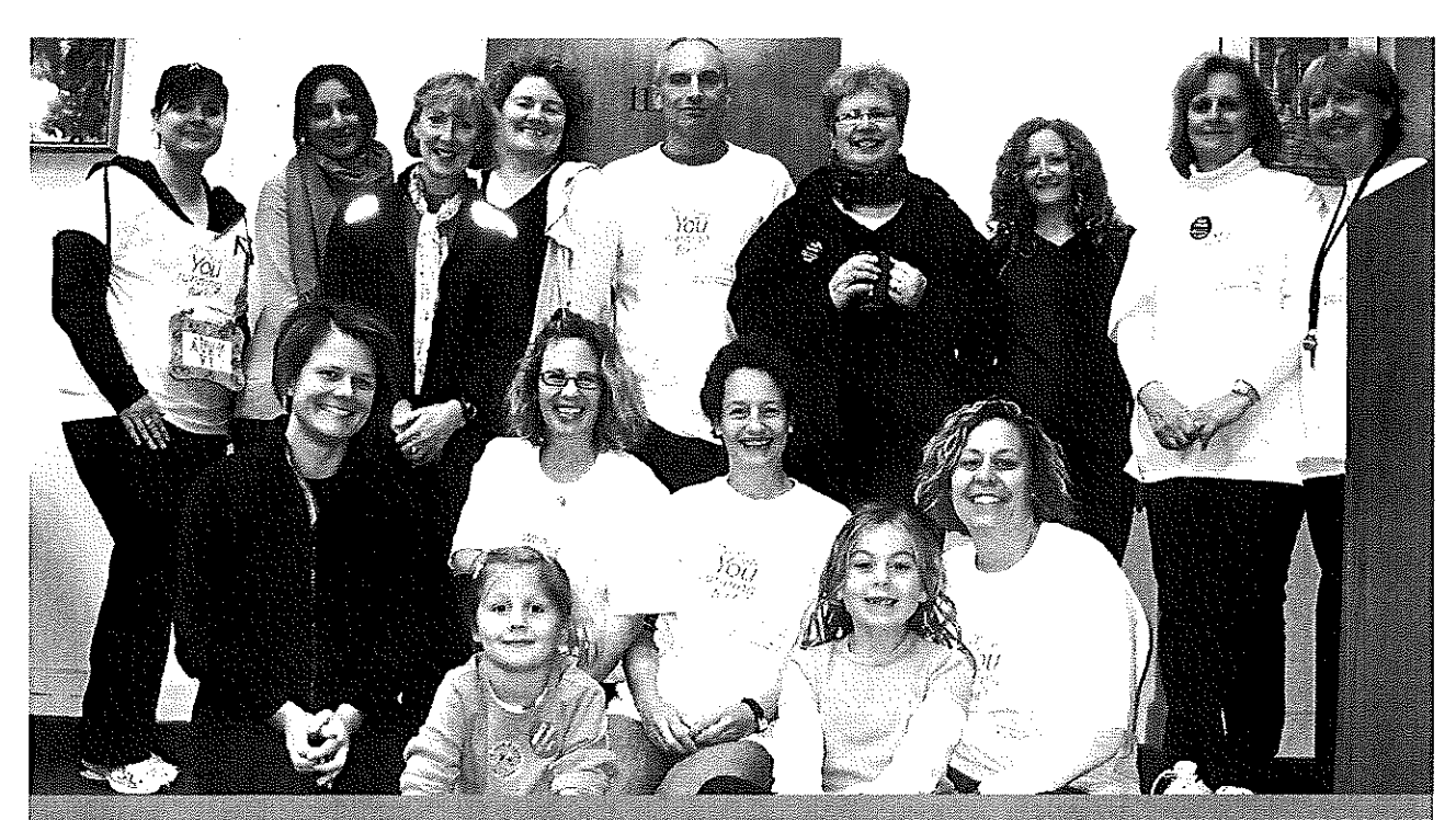
On Sunday, October 2nd, the Human Resources & Equity team ('The HR Olympians') took to the streets on the drizzly, cold day and in doing so raised awareness and more than $7,716 in donations.

Colleagues from Health & Well-being Programs & Services, the Anti-Racism and Cultural Diversity Office, the Status of Women of Office, the Sexual Harassment Office and the Community Safety Office, among others, teamed up with various partners to commemorate The National Day of Remembrance and Action on Violence Against Women with several events including a 'Working for Change' lunch at St. George campus.