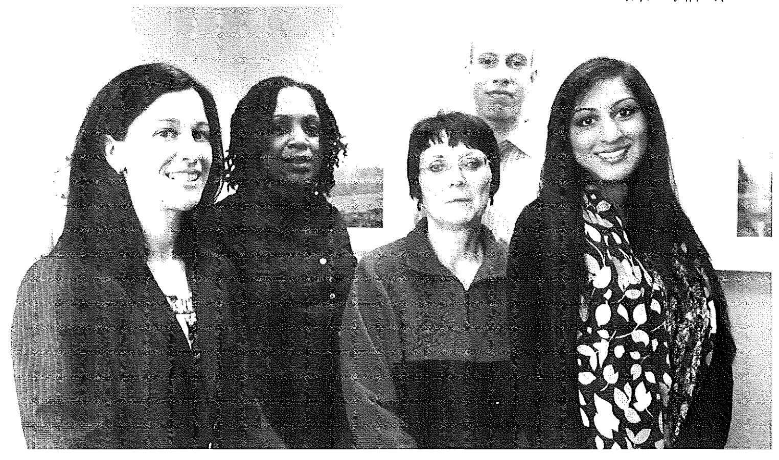
There isn't a better workplace than a workplace that accepts the differences that exist between us."