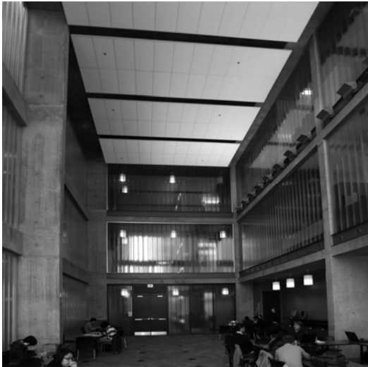
Left: Partial plan of Bahen 5 th Floor showing extent of CCIDM area. Above: View looking east within Bahen room 3200, the Great Hall of Computing. This room will receive two infilled floor levels and is the area indicated “Open to Below” on 5 th Floor plan (at left).