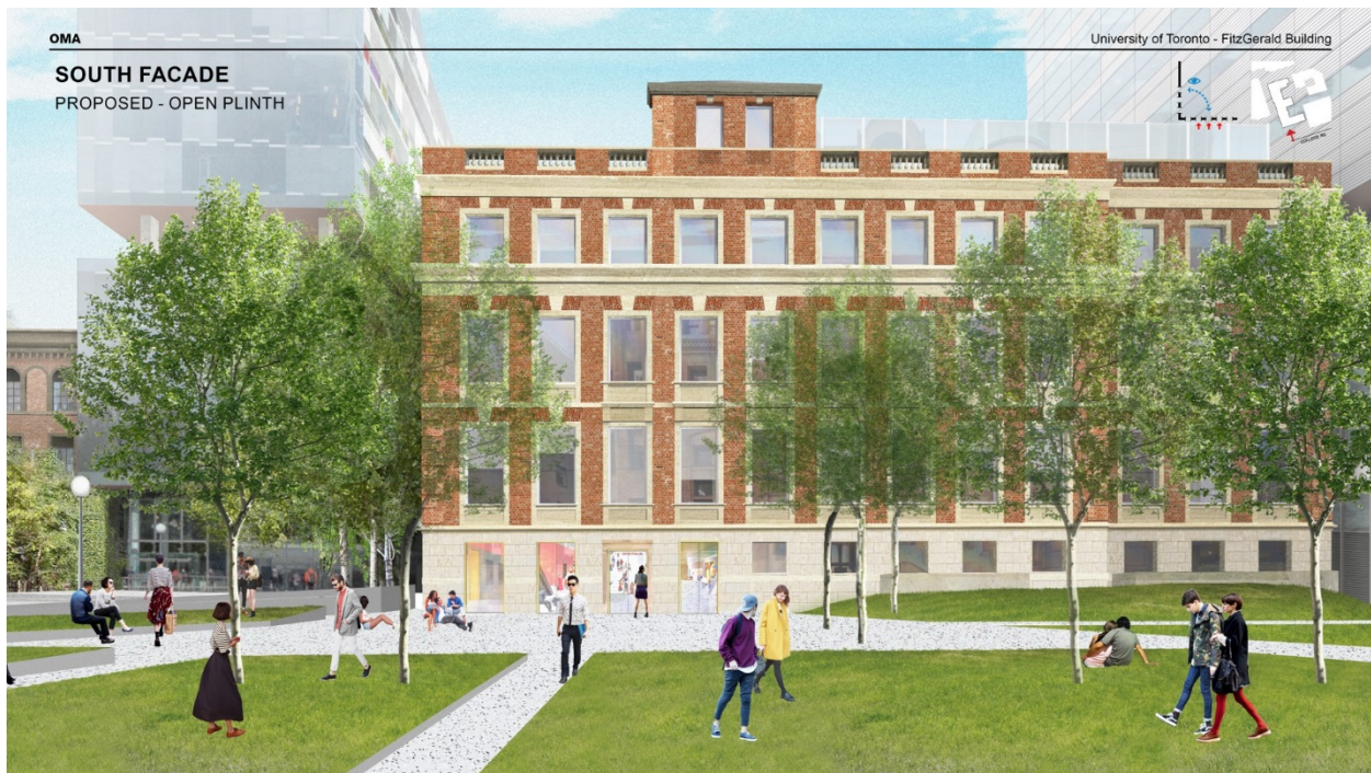
FitzGerald, showing the proposed South Façade off College Street. Note: the windows shown in the rendering propose single pane, triple glazing. An alternative approach may include metal screens to introduce divisions into the windows.