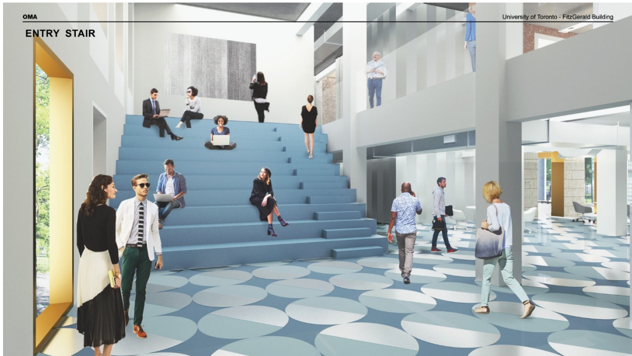
FitzGerald, showing the proposed Entry Stair off College Street, looking up towards the proposed 1 st floor