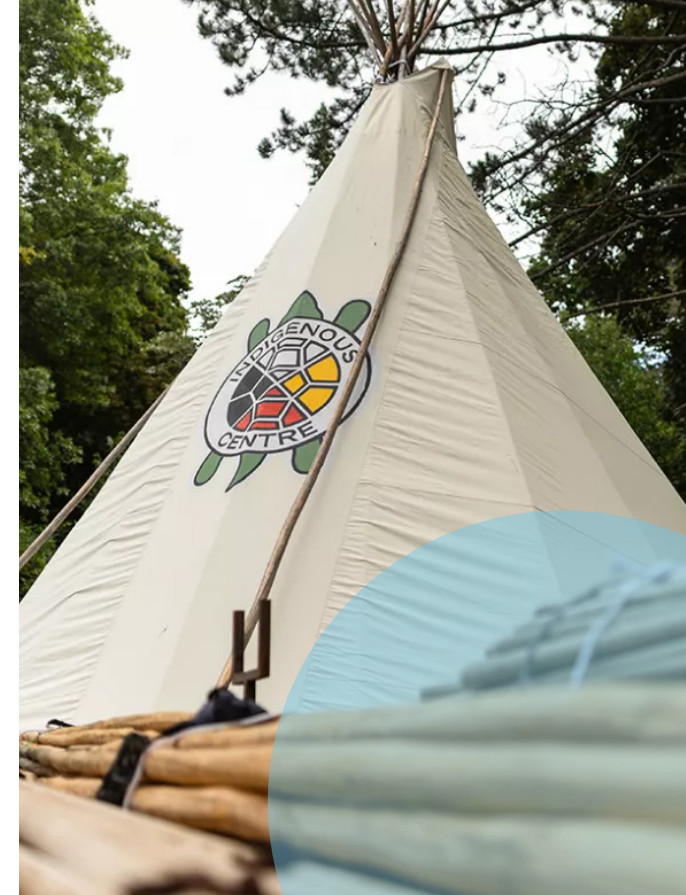
The Indigenous Centre Tipi at U of T Mississauga.

The Faculty of Music requested a consultation by the AODA Office on how to improve physical access to their buildings for students, employees, and visitors. One significant recommendation—to improve wayfinding throughout the Faculty—led to the creation of more than 130 new, accessibly-designed signs. This process involved consulting with the Faculty of Music community on the signs' text and placement. Each finished sign is numbered and includes a QR code that leads to an anonymous feedback form. Feedback will be incorporated into the final iteration of signage, to be installed by late January 2024.