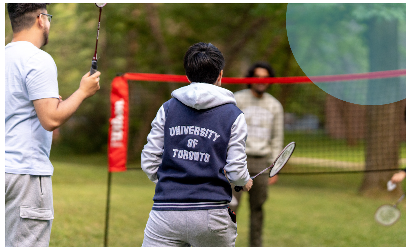
Students playing badminton, U of T Scarborough.

The Faculty of Music introduced a six-week graduate unit that aims to help vocal students with disabilities sing with confidence. The unit, called “Disability in the Voice Studio & Voice Pedagogy, A Transformative Experience,” provided education and tools to those working with vocal students with disabilities. It addressed a range of topics including neurodiversity, ableism and language, singing after a stroke, singing after/with cancer, teaching students with low vision/blindness/vision-related disabilities, those with disabilities impacting the vocal tract and breathing system, and working with students who are deaf, deafened or hard of hearing. Some sessions were recorded to allow for asynchronous learning.