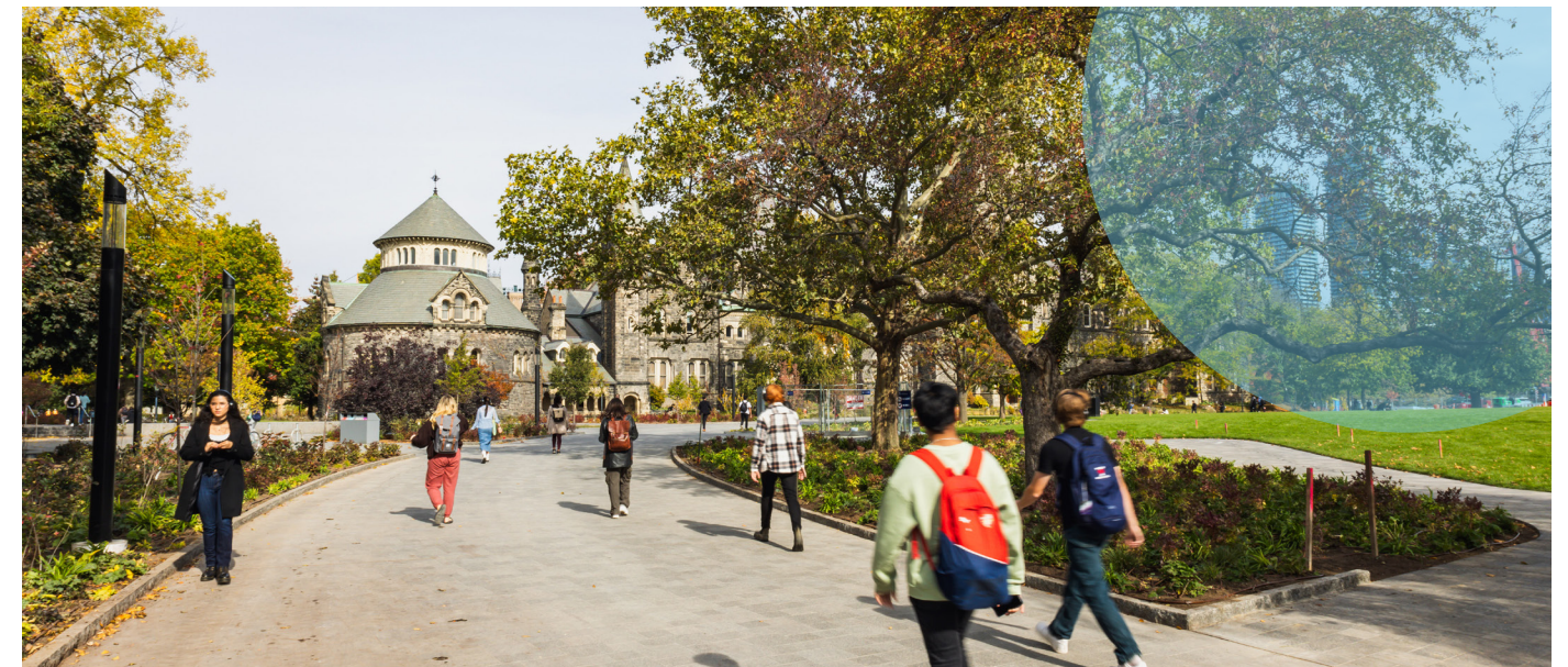
Front Campus walkway, U of T St. George.

155 College Street, Faculty Offices, Room 356 416.978.7236 aoda@utoronto.ca