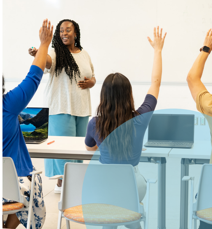
A class at U of T Scarborough.

The Centre for Teaching Support & Innovation (CTSI) expanded awareness of Universal Design for Learning (UDL) concepts through the University of Toronto Teaching & Learning Symposium, an annual event presented in partnership with the Offices of the