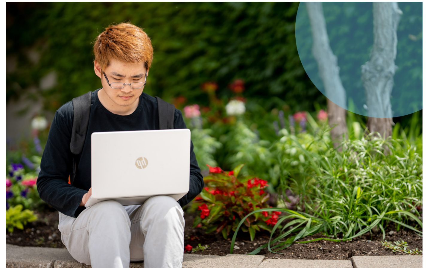
U of T Scarborough.

The IT instructional design team at the Faculty of Kinesiology & Physical Education laid the groundwork to instill accessibility reviews as a necessary part of the Quality Assurance process for Quercus course elements. This year, they expanded their services to faculty and instructors by evaluating the compliance of Quercus course materials with Web Content Accessibility Guidelines (WCAG) 2.1 Success Criteria. Such criteria include ensuring that all video content for Quercus courses has available subtitles and transcripts. Discussions continue about how best to ensure that an accessibility evaluation is completed prior to publishing course content.