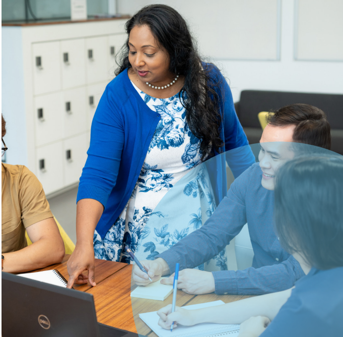
A group working at U of T Scarborough.

Under the Accessibility Improvement Program, Facilities & Services (F&S) now incorporates facilitated lived-experience consultations into all projects. In these consultations, students with disabilities provide feedback into facilities upgrades or renovation projects aimed at improving the accessibility of physical spaces. In 2023, F&S facilitated a lived experience consultation for the addition of an elevator, a ramp, and three accessible washrooms in the Clara Benson building. F&S also facilitated a lived experience consultation with caregivers of children who have accessibility