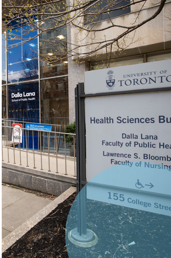
Health Sciences Building, U of T St. George.

The Lawrence Bloomberg Faculty of Nursing established a Clinical Accommodation Process that enhances the accessibility of clinical placements for their BScN and MN programs. Program directors and instructors additionally incorporated considerations for accommodations into academic and clinical settings. To expand awareness and understanding of related challenges and opportunities, a group of faculty members and a graduate student began work on a scoping review of literature that documents processes, experiences, and outcomes of accommodating Nursing students.