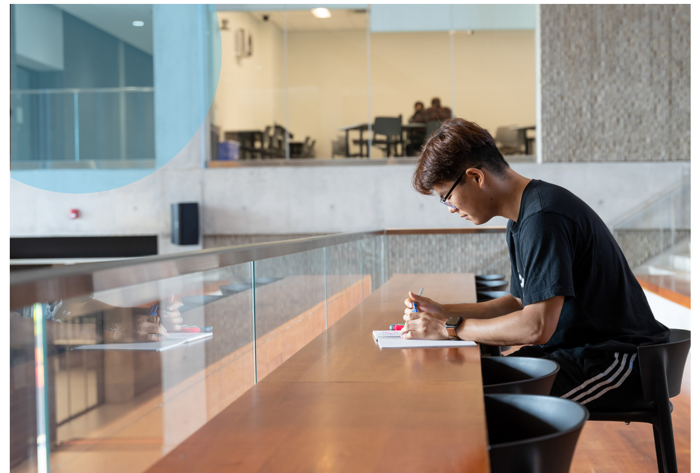
A student studies in Maanjiwe nendamowinan, U of T Mississauga.

The Centre for Teaching Support & Innovation (CTSI) released a Quercus resource hub focused on UDL course design and began developing a self-paced virtual resource on Course Design Foundations that integrates a UDL focus. CTSI expects to release the latter resource in Spring 2024.