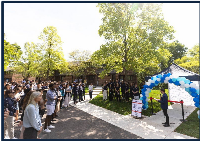
Leacock Lane Grand Re-Opening Event August 2023