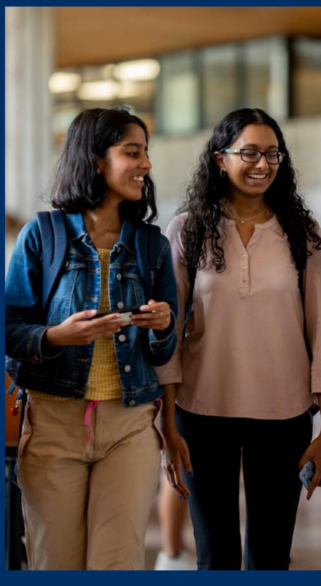
Supporting Campus and Institutional Strategic Plans (directly linked to inclusive Excellence)