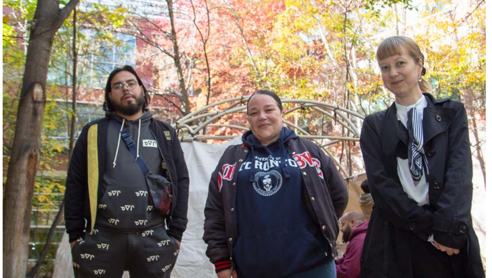
Students at the First Nations House Teaching Lodge.

U of T remains committed to its role in advancing reconciliation across our three campuses in ways that are relevant to and collaborative with Indigenous members of the U of T community and the host nations. As the Office of Indigenous Initiatives continues to grow, so will its impact on the U of T community in advancing Indigenous issues with transparency, accountability, and proficiency.