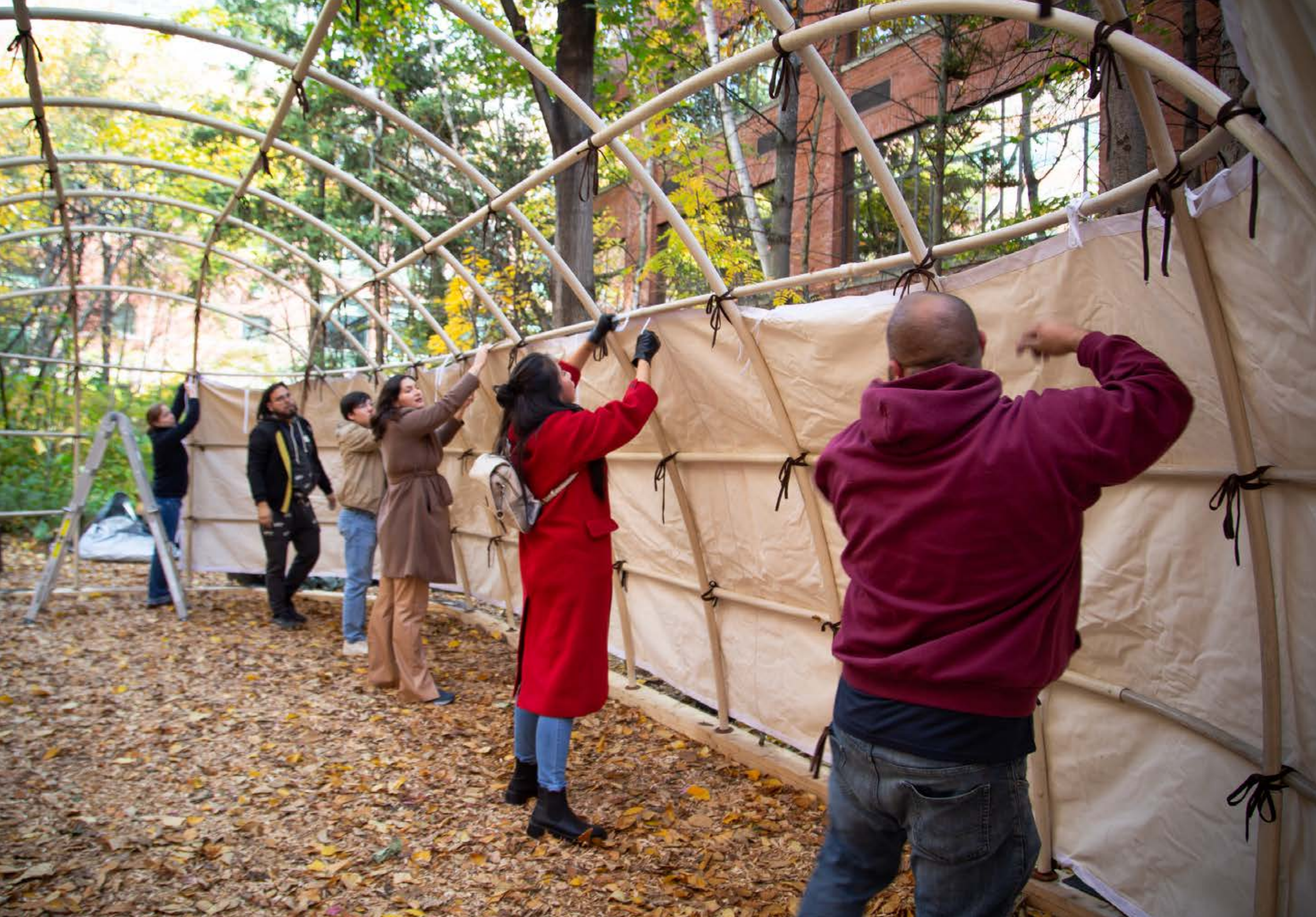
Staff and Students raise the First Nations House Teaching Lodge.