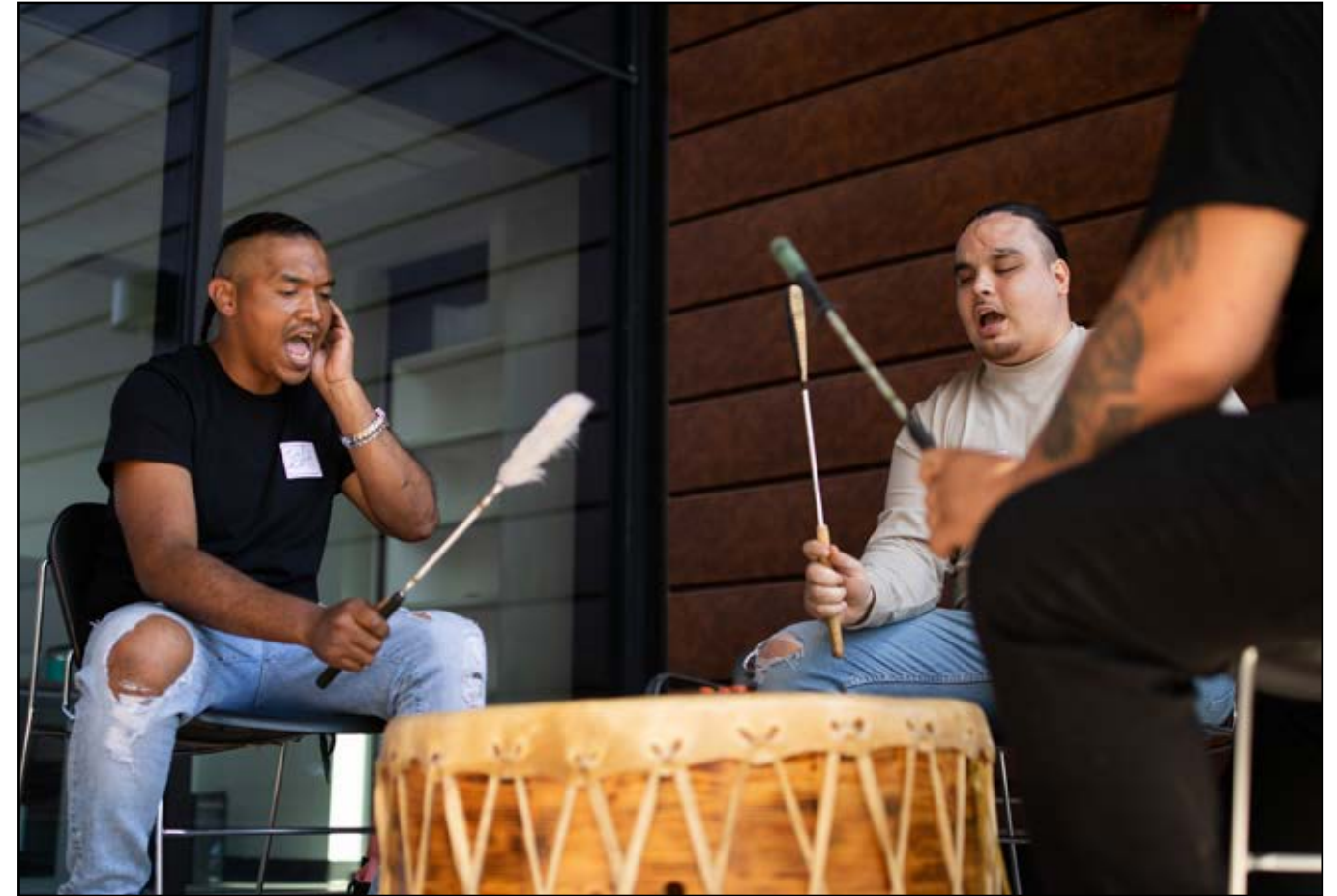
Debezdaguzh Singers at UTM’s Drum Social to kick off National Indigenous History Month.