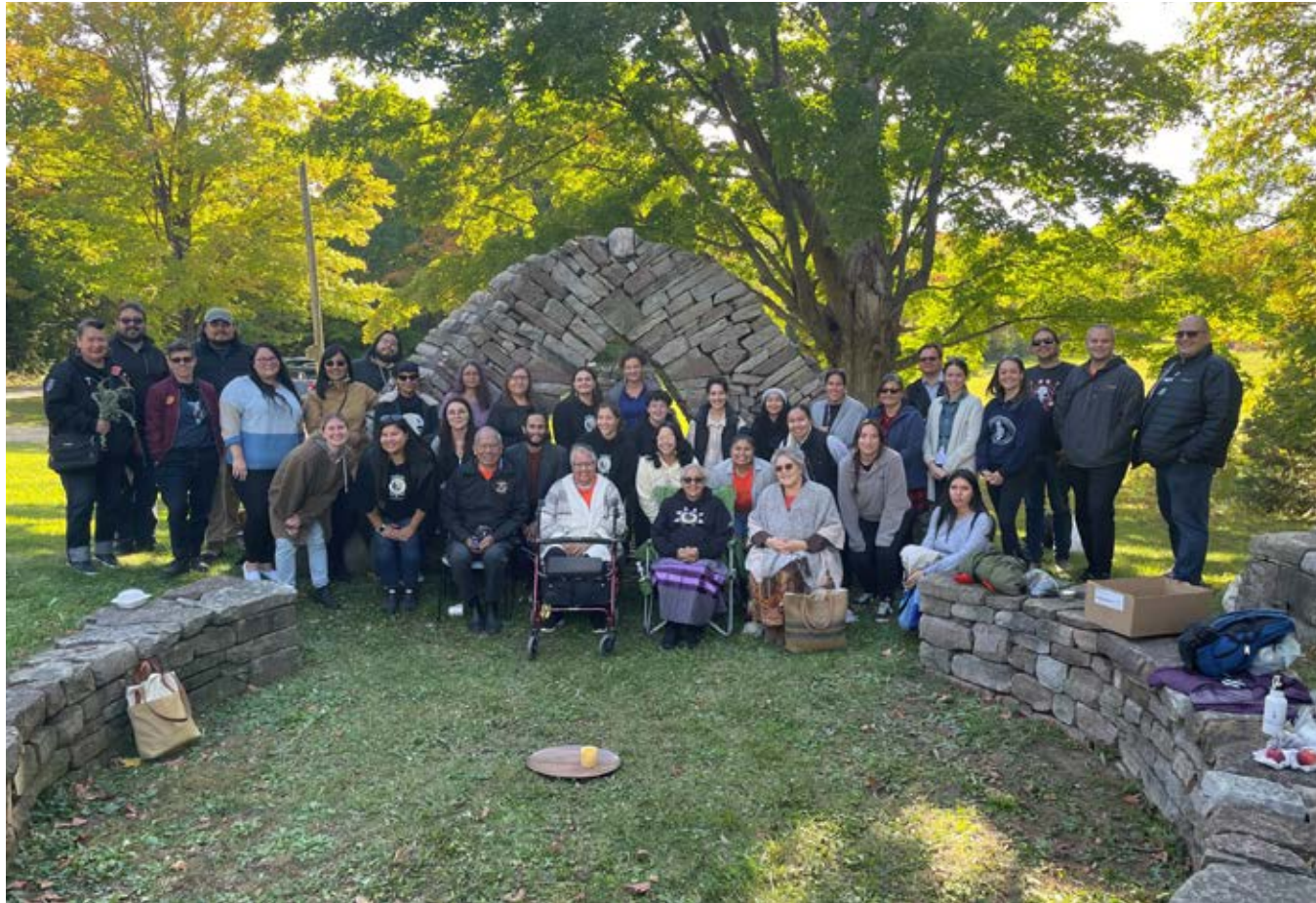
Indigenous staff, faculty, librarian and student gathering at Hart House Farm, Fall 2022