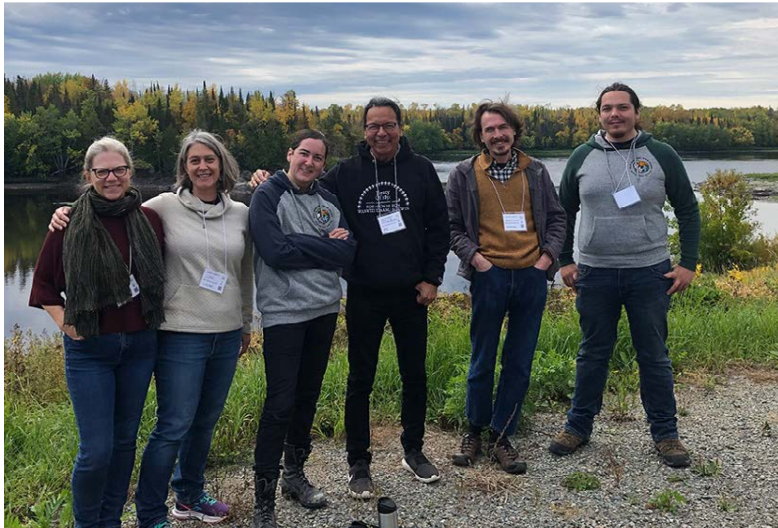
The Great Lakes Research Alliance for the Study of Aboriginal Arts & Cultures (GRASAC) researchers

The Wecheehetowin Final Report's Calls to Action emphasize the importance of investing in education to establish ethical research practices while promoting respectful relationships with Indigenous Peoples.