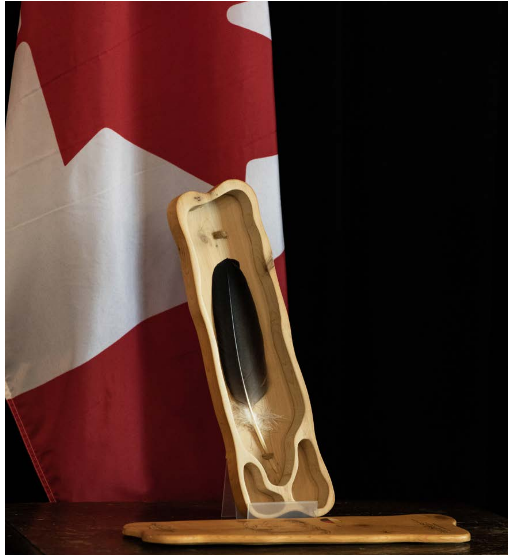
Eagle feather presented to the University during the National Day for Truth and Reconciliation at Hart House, University of Toronto St. George campus

During the John H. Daniels Faculty of Architecture, Landscape, and Design spring convocation, an Honorary Doctor of Laws degree was awarded to Douglas Cardinal, renowned Indigenous architect who has a long-time commitment to sustainable designs and creating iconic buildings for the nation. Dr. Cardinal previously held the Frank O. Gehry Chair at the Faculty in 2020-21, and currently continues to work within the Faculty as the Decanal Advisor on Indigenous Knowledge.