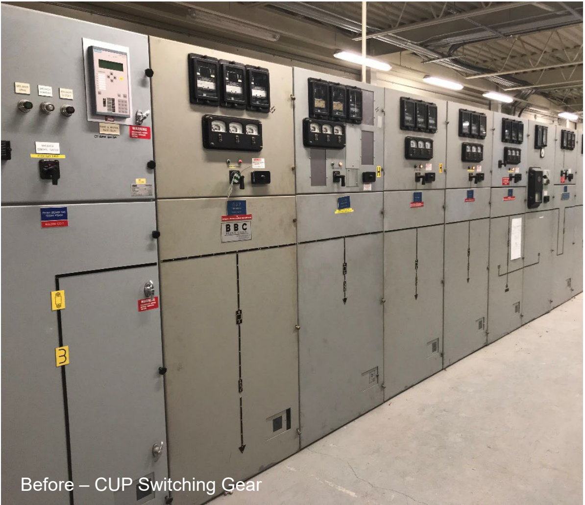
Before – CUP Switching Gear