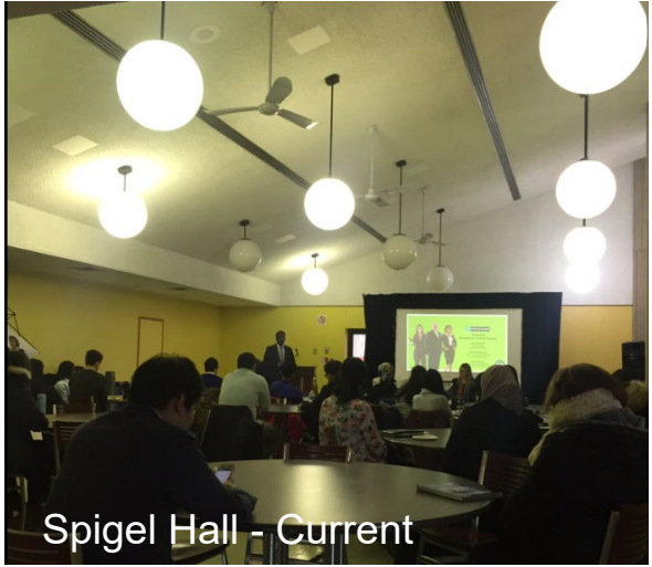
Spigel Hall - Current