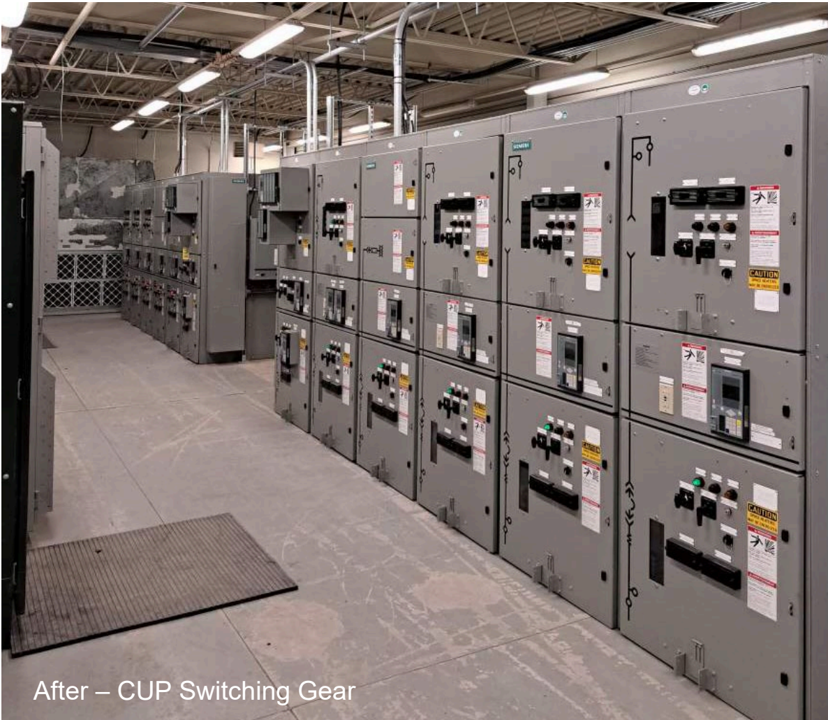
After – CUP Switching Gear