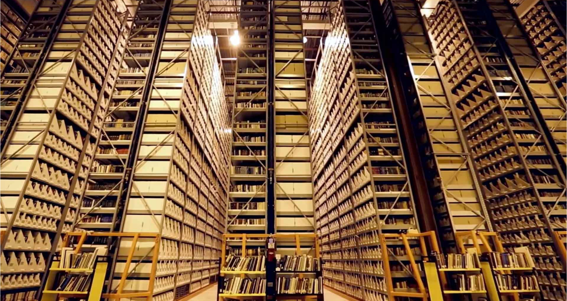
Existing High-density Storage Shelving System