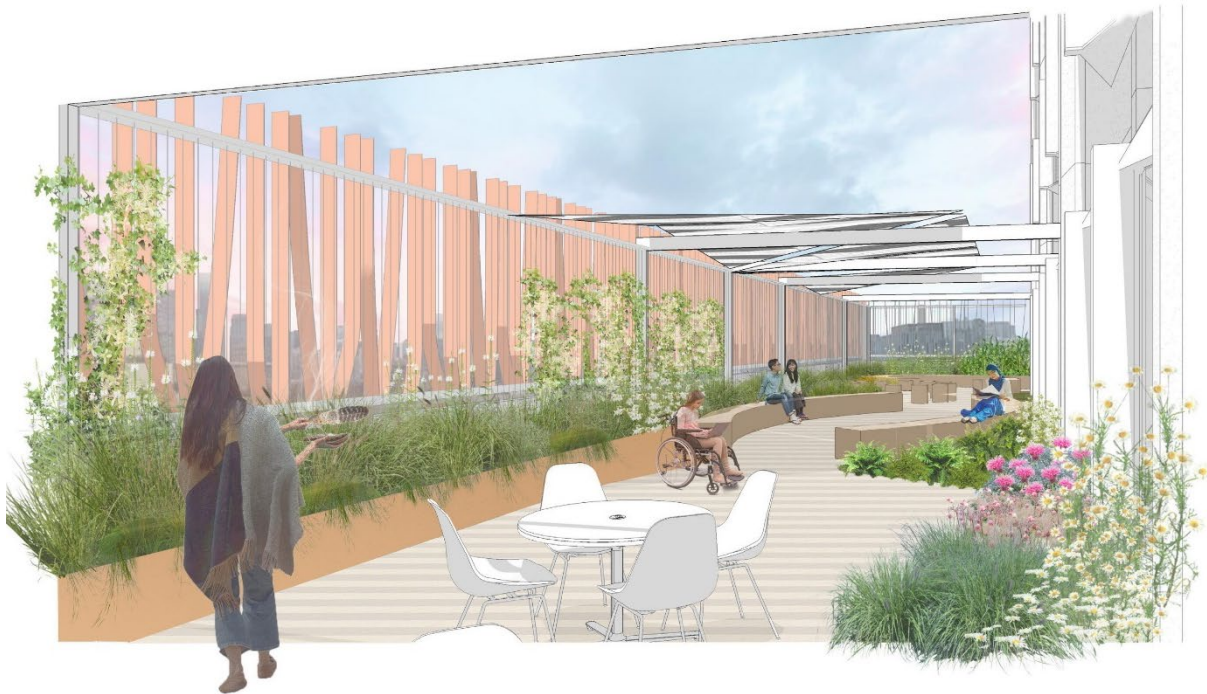
IEN Social & Cultural Practice Space (South Terrace) looking West