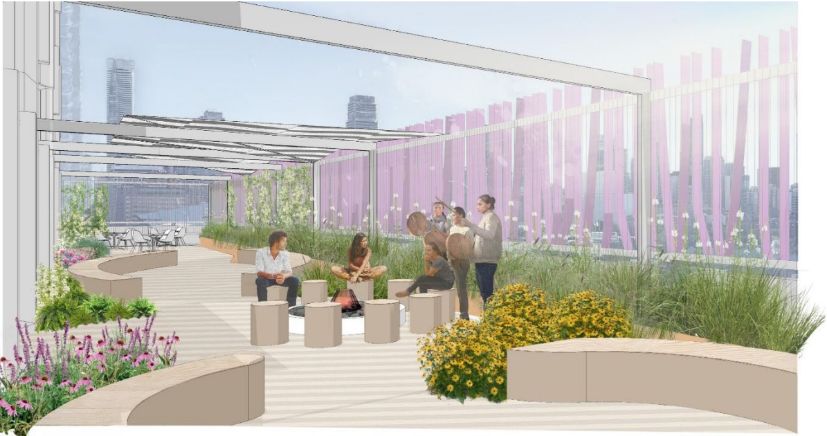
IEN Social & Cultural Practice Space (South Terrace) looking East