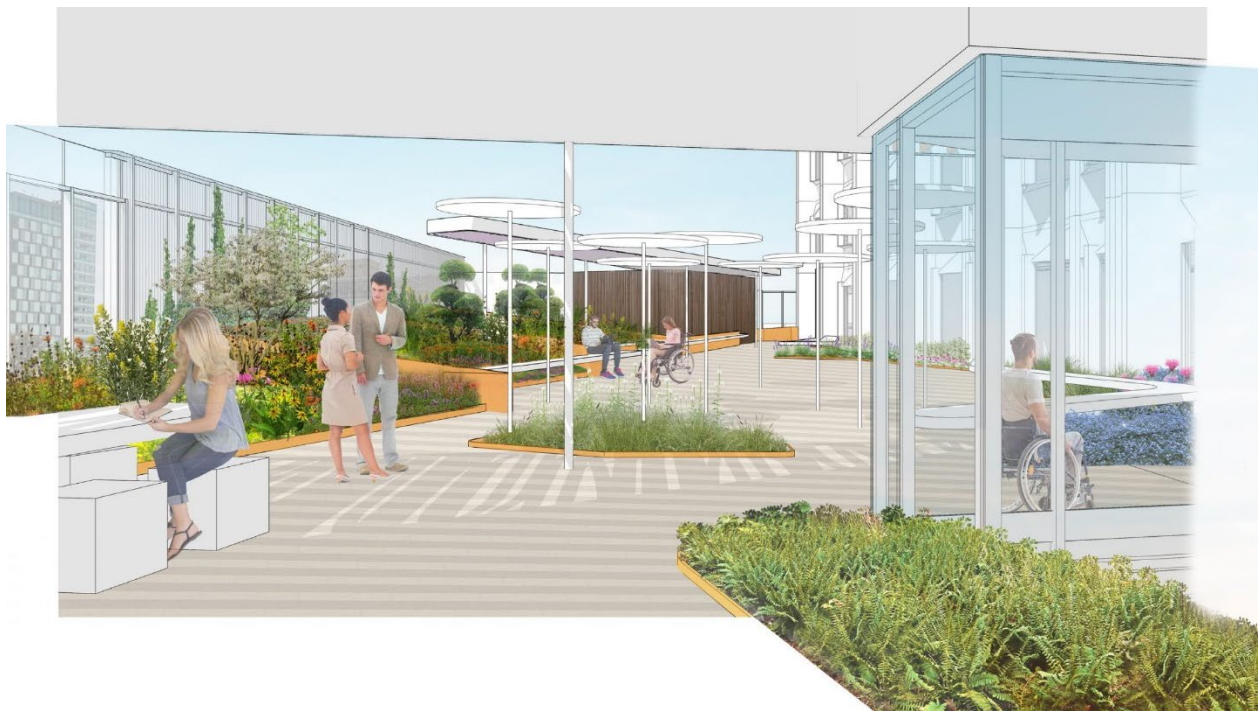
OISE Community Roof Garden (West Terrace) looking North (Source: Gow Hastings Architects)