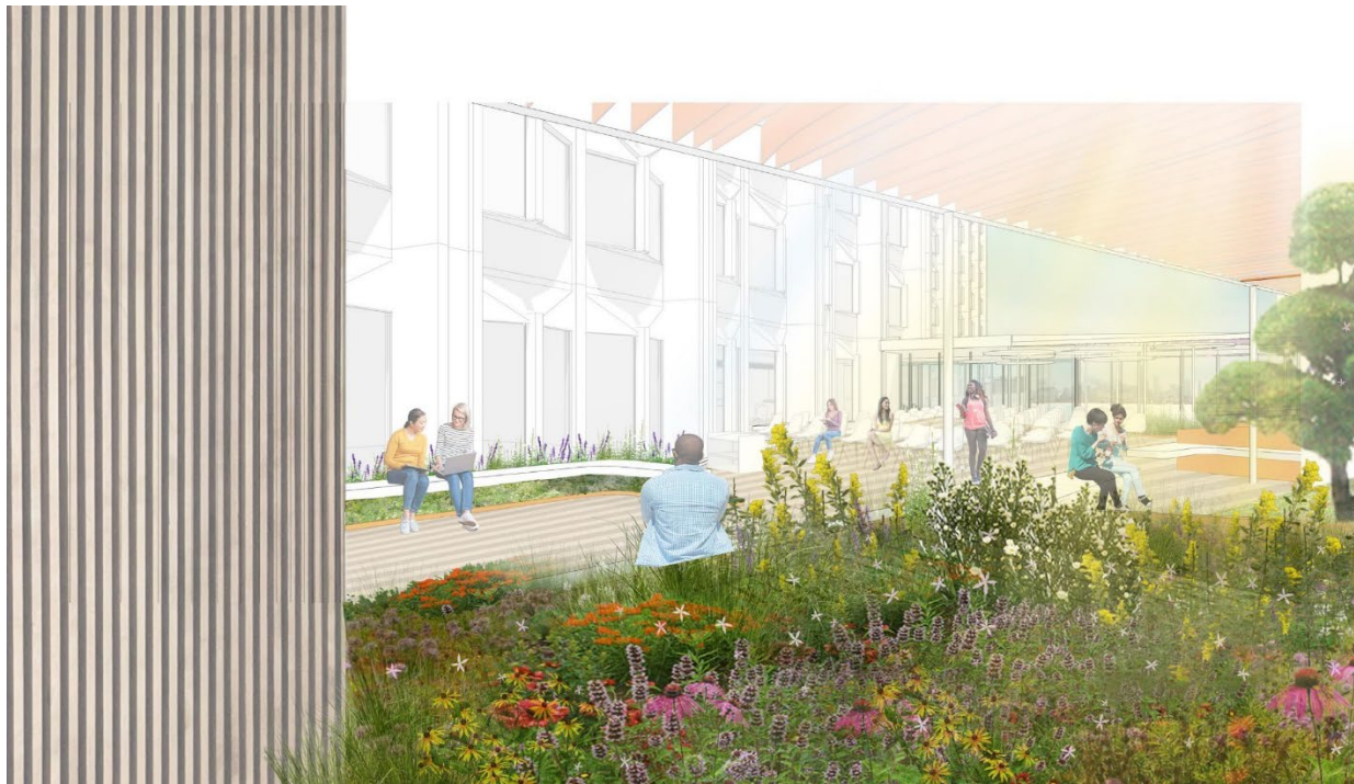
OISE Community Roof Garden (West Terrace) looking South (Source: Gow Hastings Architects)