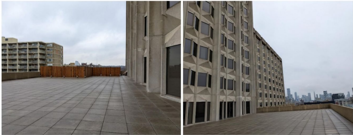
Views of the existing West Terrace