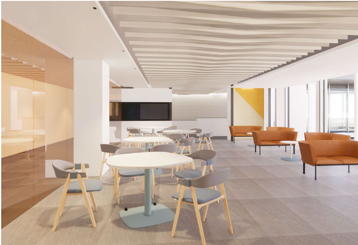
View of OISE Lounge (Source: Gow Hastings Architects)

Existing rooms 5-210 and 5-220 are being combined into one room as the proposed OISE Lounge intended to serve as an entrance and natural connection to the OISE Community Roof Garden. The OISE Lounge accommodates a range of activities and provides connection and openness for special events. The Lounge features a servery, flexible seating arrangements to accommodate different work styles, and a casual lounge with visibility and transparency from the corridor and out to the OISE Roof Community Garden.