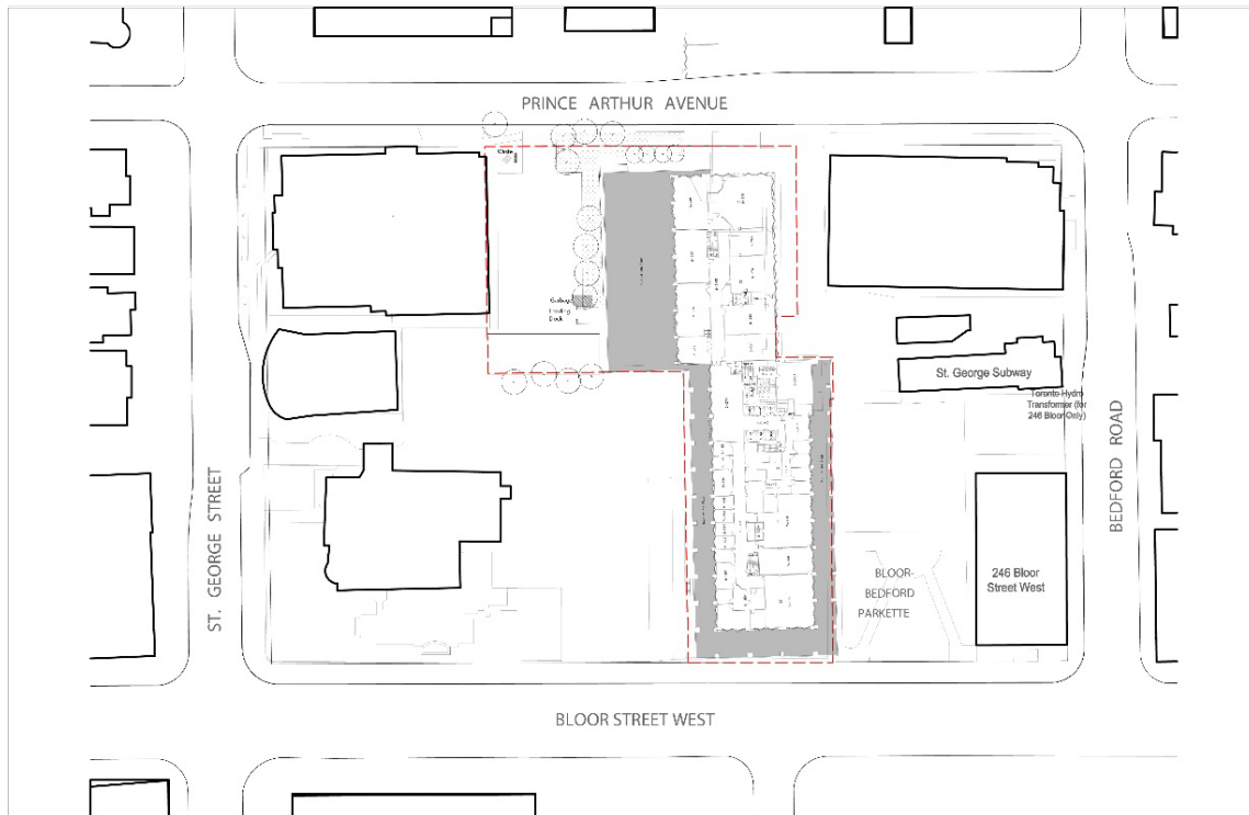
5 th Floor Plan showing Scope of Roof Terrace

On 64 Prince Arthur Ave, a 19-storey residential building development application was submitted in 2017. The decision on this application has been appealed to the Ontario Municipal Board (OMB). A redesigned submission was put forth in January 2020. Project is still in pre-construction.