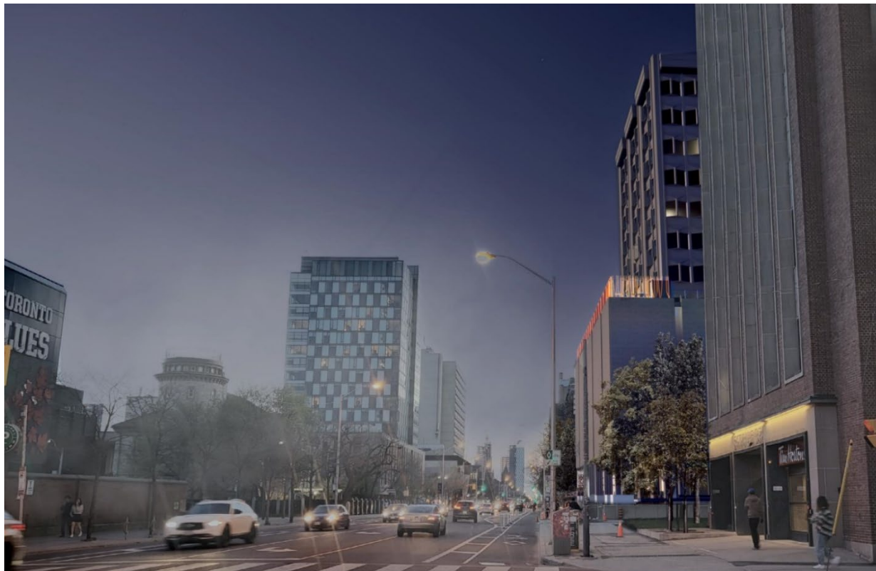
View along Bloor Street West of the IEN Social & Cultural Practice Space

Secondary effects at Level 5 include the loss of informal study space during construction, and the relocation of HVAC roof units. There will also be partial closure of egress from the stair being extended up to the roof level from Level 4, as well as the relocation of a prayer & meditation room (4409) and an amendment to the size of classroom 4410. The prayer & meditation room will be housed in a temporary location and then move to 4410 after construction. A new Classroom is to be provided by OISE for LSM use to replace the lost 36-student classroom 4410 pending LSM approval. The current Lounge on Level 5 will not be accessible during construction and a temporary lounge is being readied and made available for use on Level 3 prior to the onset of construction. Construction is targeted to begin in May 2023 with occupancy anticipated for July 2024.