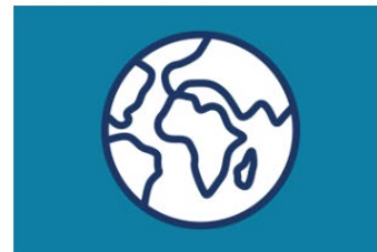
International or Out of Province Supports