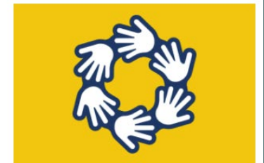
Equity and Human Rights Services