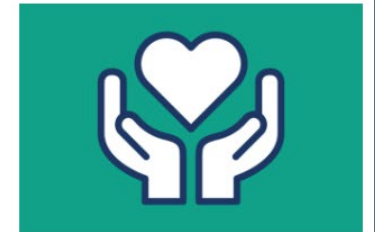
Sexual Violence Supports