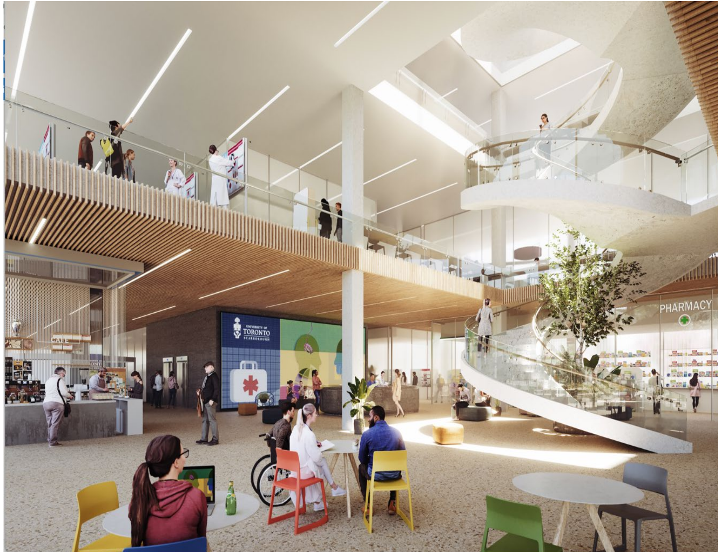
Conceptual artistic rendering created by ooe studio