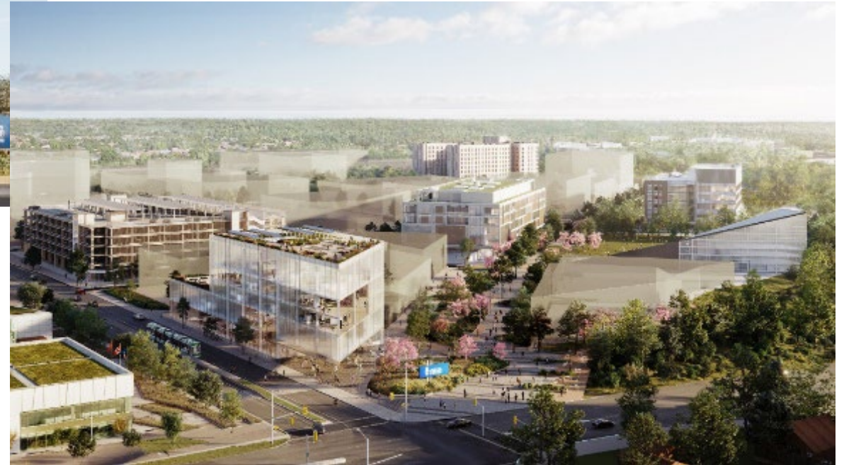
Concept Aerial View of Future UTSC North Campus from N-W