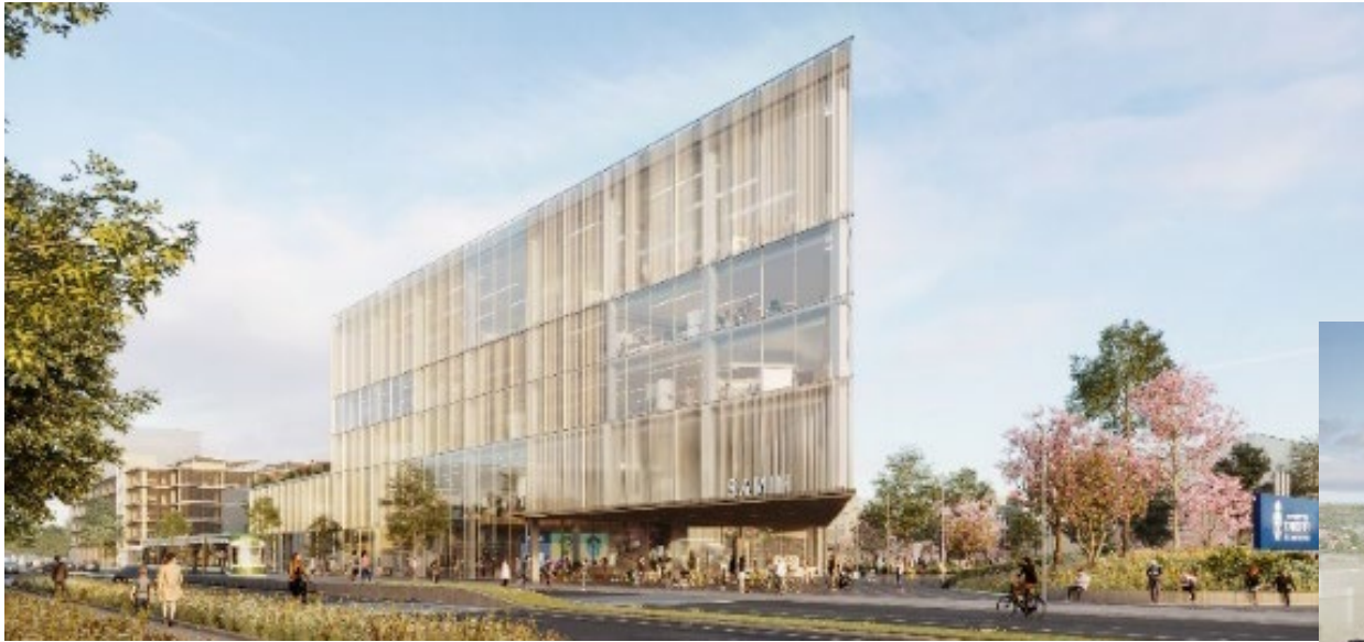
Concept View from UTSC Campus Arrival at Morningside & Military Trail