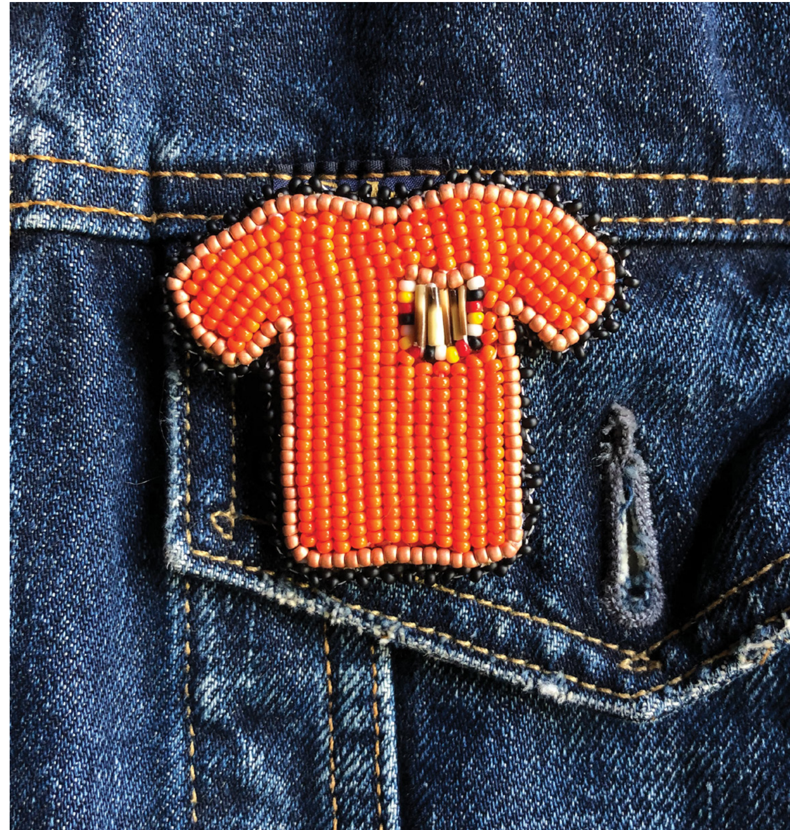
Beaded orange shirt by Rosalee Mitchell.