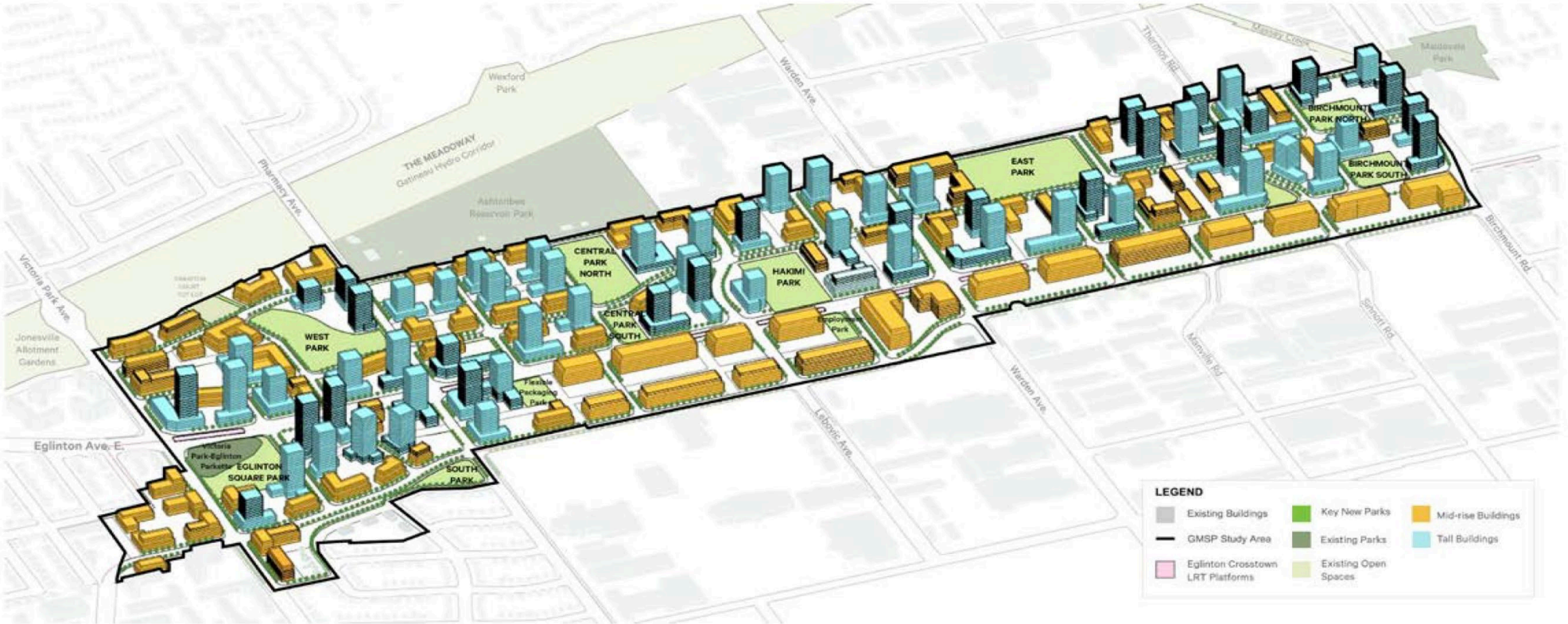
Demonstration 3D View GOLDEN MILE SECONDARY PLAN STUDY FINAL REPORT