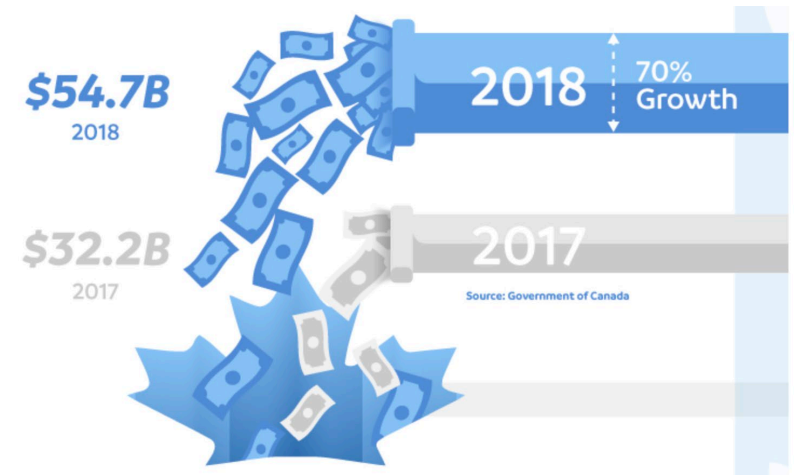
Foreign Direct Investment into Canada