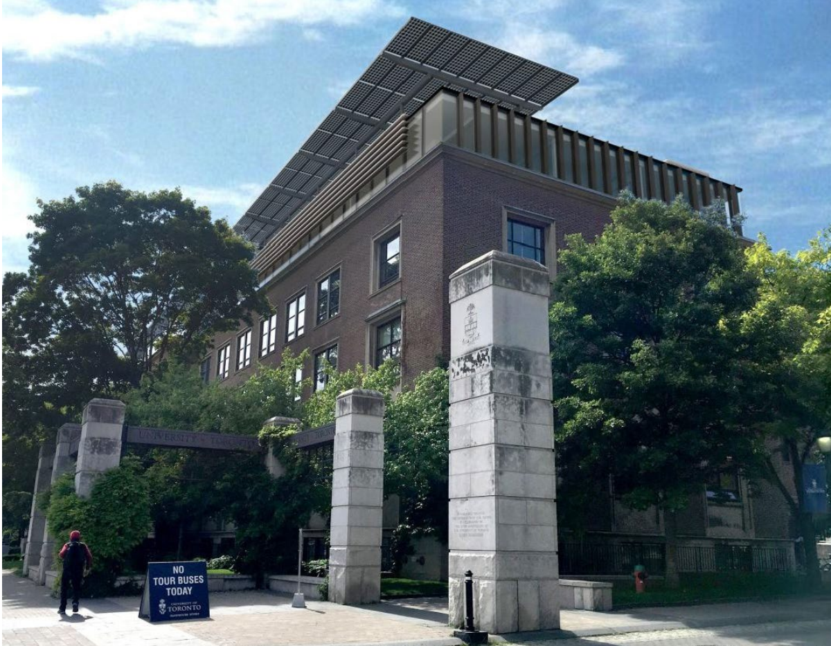
Proposed Sustainability Lab, Southeast corner of Wallberg Building at College St and King's College Road