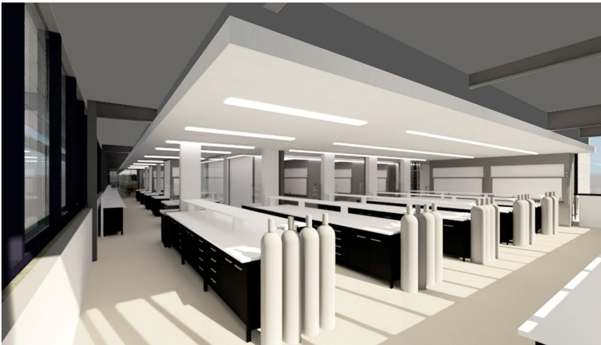
Proposed Open Research Lab, Wet