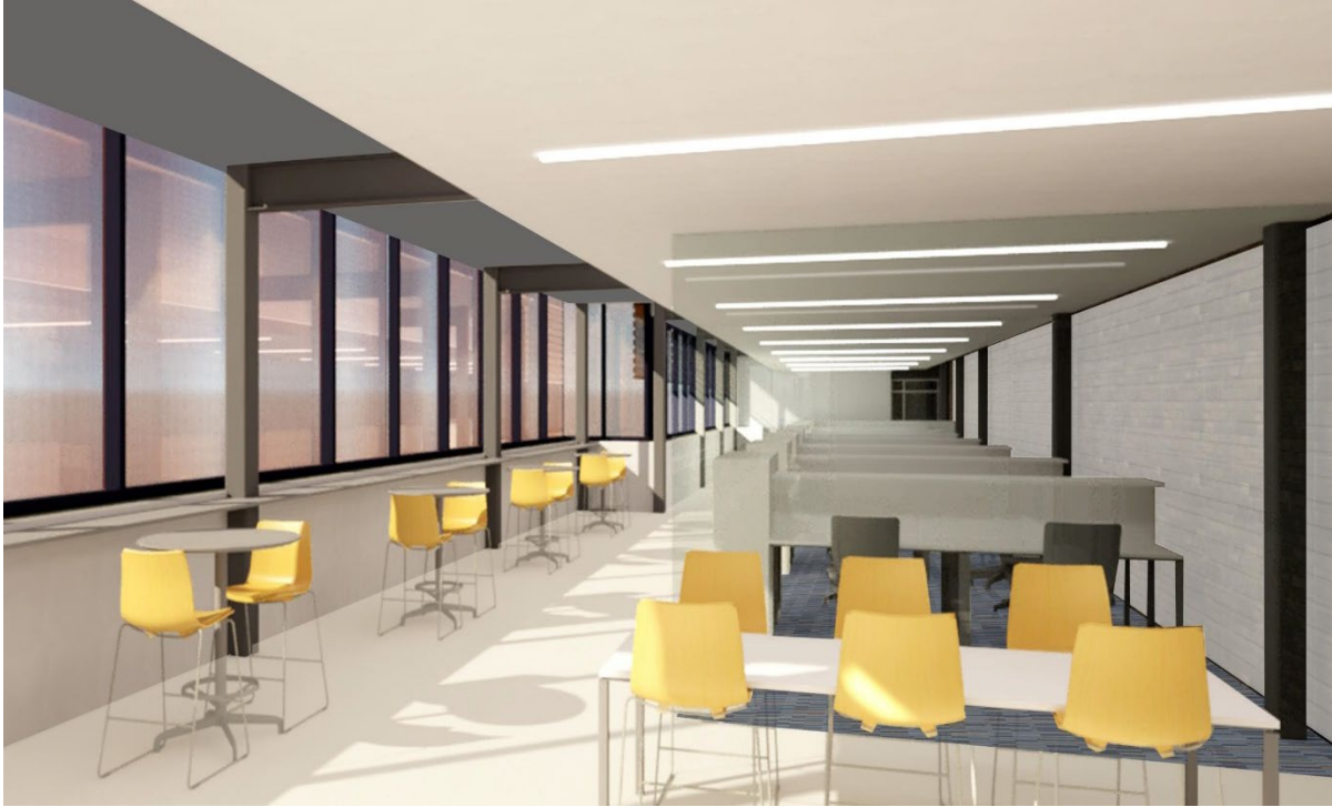
Proposed Open Research Office and Collaboration space for Graduate Students