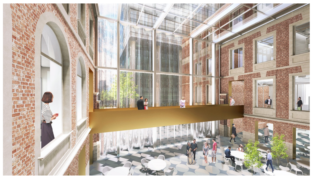
FitzGerald, showing the proposed Atrium space from 1st floor, looking east towards Leslie Dan Pharmacy Building