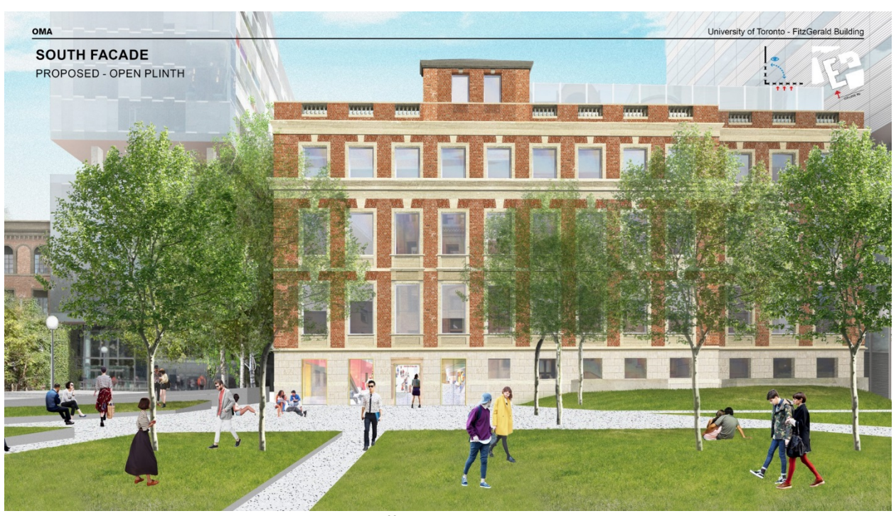
FitzGerald, showing the proposed South Façade off College Street. Note: the windows shown in the rendering propose single pane, triple glazing. An alternative approach may include metal screens to introduce divisions into the windows.