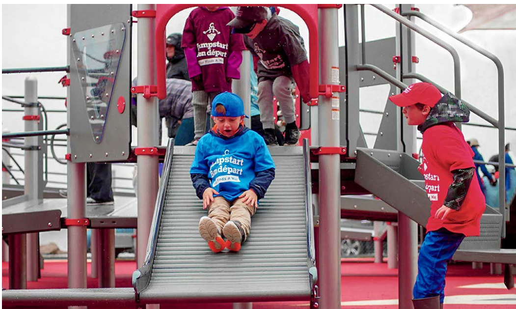
Featured in the Innovation & Partnerships section: researchers from the University of Toronto are working with Canadian Tire Jumpstart Charities, to feature traditional play components modified for children of all abilities

For an accessible version of this report, please contact us at vp.hre@utoronto.ca