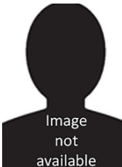
Image not available TBD Registrar and Director of Enrolment Management, UTM