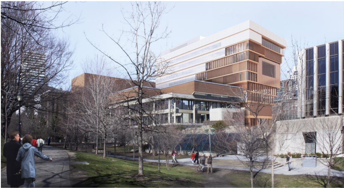
View 3 - Looking northeast from Philosopher's Walk.