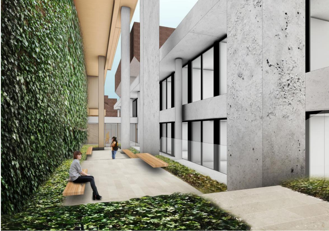
View 5 – Proposed East Courtyard between CCC and the Edward Johnson building.