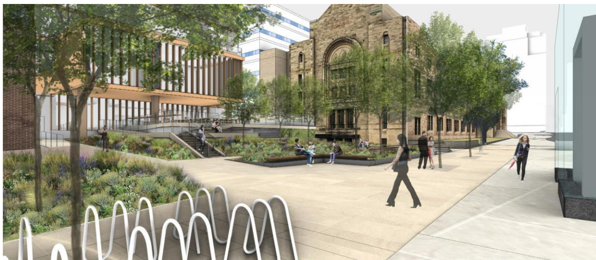
View 4 – Proposed North Plaza between CCC and the ROM.