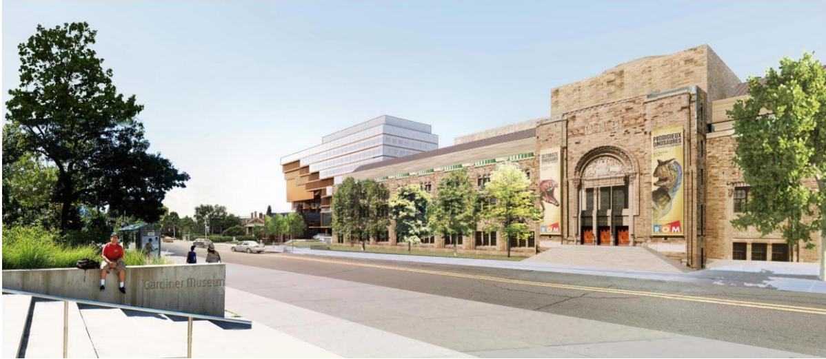
View 2 - Looking southwest from Queen's Park and Bloor Street.