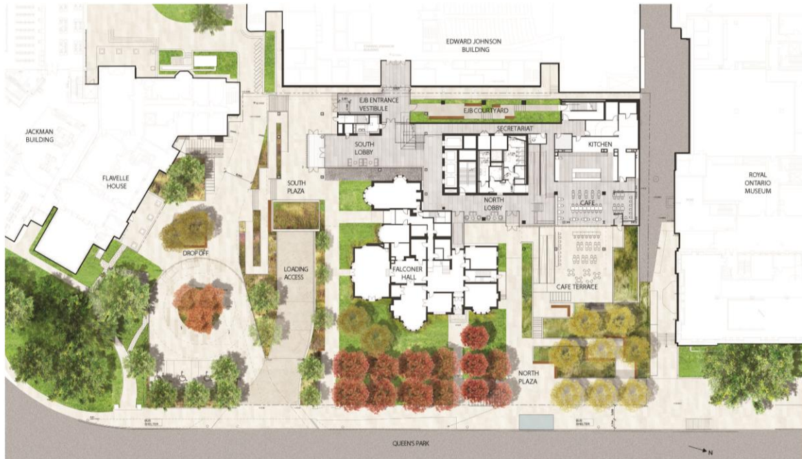
Proposed CCC Site Plan