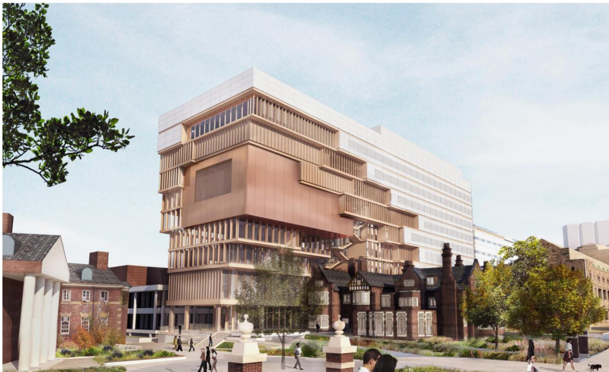
View 1 - Looking northwest from Queen's Park.

A Zoning By-Law Amendment application was submitted in February 2019, followed by a subsequent rezoning resubmission, combined with Site Plan Control application in October 2019. It is anticipated that the rezoning will be in front of City Council in June 2020.