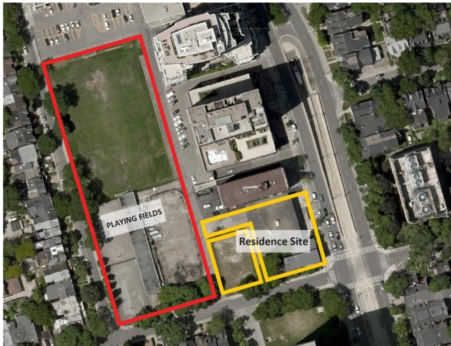
Figure 1.2 Existing Site Aerial

designate 698 Spadina under the Ontario Heritage Act, on the basis of a recommendation and report from Heritage Preservation Services. After discussions with the City, the project was appealed to Ontario Municipal Board in May of 2017. The University entered into mediation with the City and other parties in February 2018. A resolution was reached in May 2018 that established a tower height of 75.05m, removal of the commercial floors and a total bed count of 511. The City passed the zoning amendment bylaw in July of 2018. The project is currently under Site Plan review, for which an application was made on December 19, 2018.