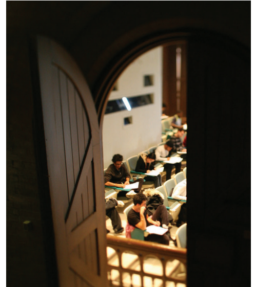
Students in University College Classroom

In recognizing there are various ways to make education more accessible, the University has worked to provide resources on how to do so. Information and advice on the incorporation of accessible course design have been widely disseminated with support provided. This is in line with AODA requirements to provide training to educators in this area and further helps to create accessible spaces. Examples of this have included: an AODA Office Tour; whereby we visited various departments and faculties to discuss accessible course design; workshops provided to faculty by both the Teaching Assistant Training Program (TATP) and the Centre for Teaching Support & Innovation on accessible teaching practices; resources provided to TAs on fostering accessible learning environments (see Key Focus below); and the working of the Online Learning Strategic portfolio to provide resources on designing interactive learning objects like Articulate Storyline. This year as part of the Learning Portal renewal process, consultation on its accessibility took place, including a testing session at the Students for Barrier-free Access Computer lab.