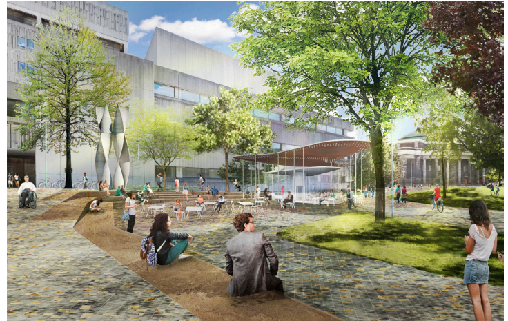
Designers rendering showing Landmark area at Medical Science Building

In addition to the goals of the AODA in the built environment, it is important that our buildings and Public Spaces are safe and accessible to the University community. Whilst the University is meeting its regulatory requirements under the Design of Public Spaces Standards and others, we also seek to meaningfully incorporate accessibility into building design and operations. Examples of this work include the accessibility designs of the Landmark Project, with the goal of revitalizing the major public spaces of the historic St. George campus (see Key focus below); the continuing renovations across St. George to improve accessibility on campus, including those at OISE; and the ongoing improvements made to the AODA Office's Building Access Notices system.