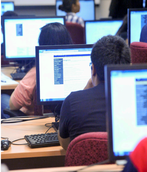
Students at Computers

Making our online spaces accessible is another important aspect of ensuring our information and communications reaches as many members of the University community as possible. This year the AODA Office, as well as communicators across our campuses, have worked to address barriers to web accessibility. This has included the AODA Officer assisting in incorporating a session on accessible communications at TechKnowFile , a free technology conference offered to all faculty and staff, the AODA Office delivering regular accessible communications workshops on all three campuses, the AODA Office providing more resources on its website related to accessible communications (see Key focus below) updating the Bulletin for better keyboard accessibility, and the University's accessibility offices deploying a site license for Kurzweil 3000 on all three campuses.