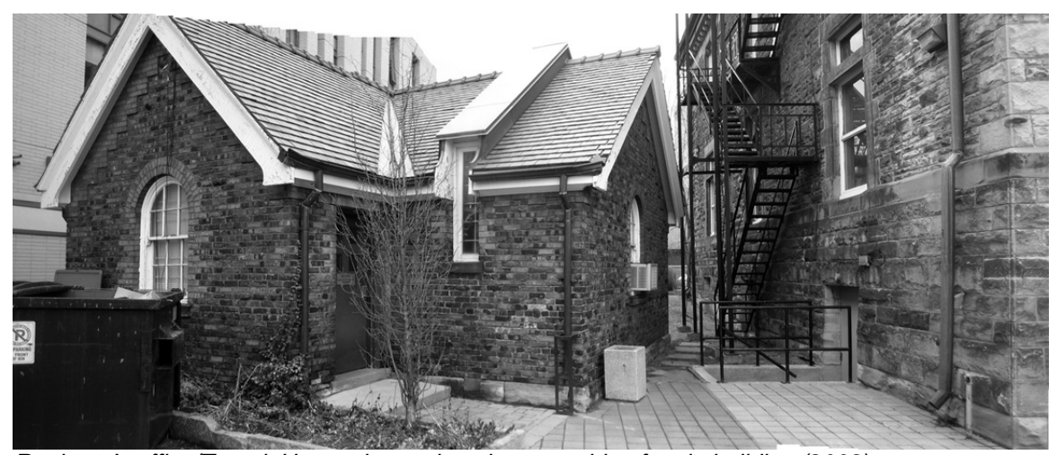
Registrar's office/Transit House, located on the west side of main building (2009)

office activities. This small building could also be converted into student study space, meeting or support space for the School.