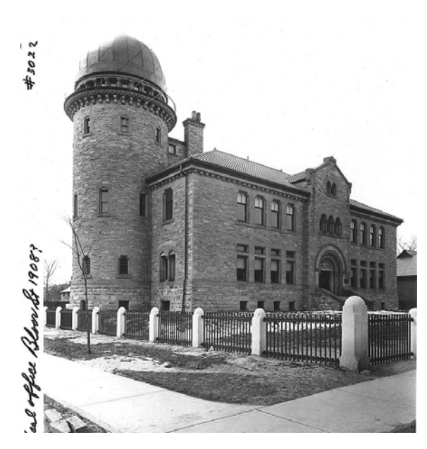
Building soon after completion (1908)

The main building at 315 Bloor Street West, originally named the Toronto Observatory, was designed by Burke and Horwood Architects and constructed in 1907. The building was originally a meteorological observation centre and operated as such well into the latter half of the 20<sup>th</sup> century, when it was then converted for office use. It was added to the City of Toronto's Heritage Properties Inventory in 1973.