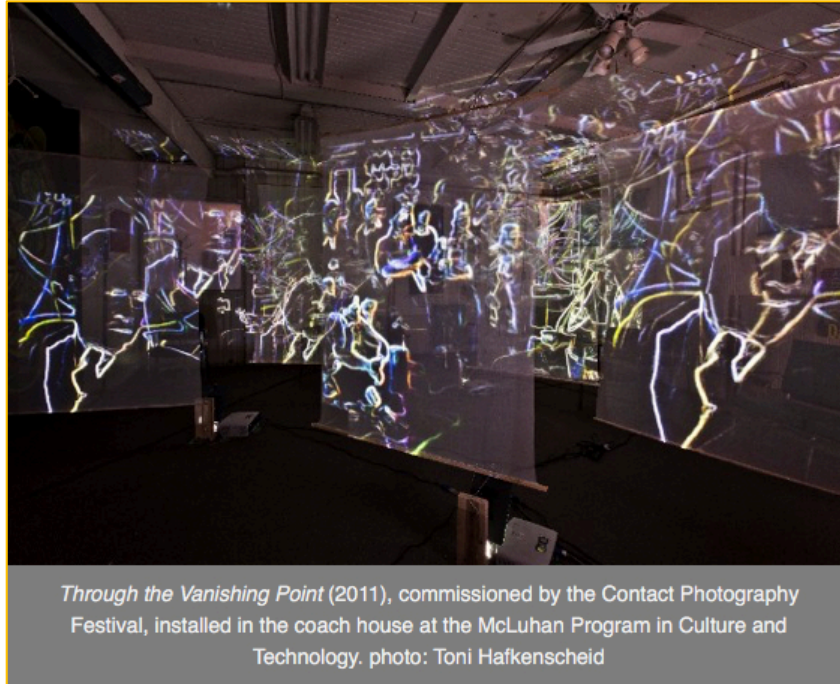
Through the Vanishing Point (2011), commissioned by the Contact Photography Festival, installed in the coach house at the McLuhan Program in Culture and Technology.

Centre for Drama, Theatre & Performance Studies