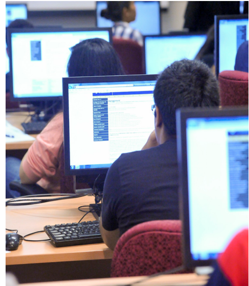
Making our online spaces accessible is another important aspect of ensuring our information and communications reaches as many members of the University community as possible. This year the AODA Office, as well as communicators across our campuses, have worked to address barriers to web accessibility. This has included the AODA Officer assisting in incorporating a session on accessible communications at <a href="TechKnowFile">TechKnowFile</a>, a free technology conference offered to all faculty and staff, the AODA Office delivering regular accessible communications workshops on all three campuses, the AODA Office providing more resources on its website related to accessible communications (see Key focus below) updating the Bulletin for better keyboard accessibility, and the University's accessibility offices deploying a site license for Kurzweil 3000 on all three campuses.