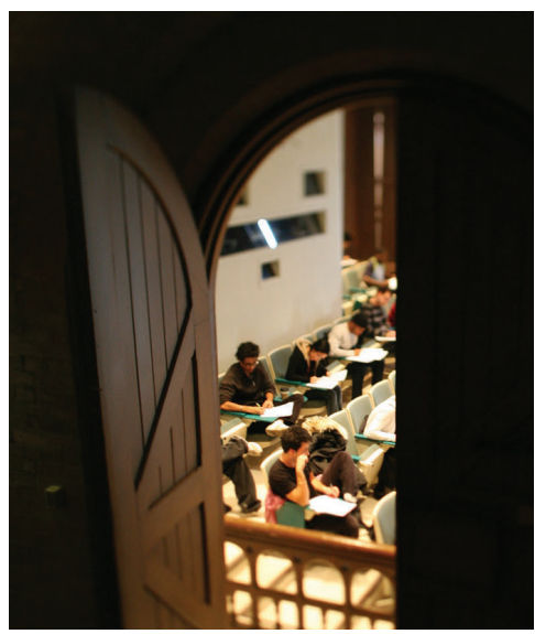
Students in University College Classroom

In recognizing there are various ways to make education more accessible, the University has worked to provide resources on how to do so. Information and advice on the incorporation of accessible course design have been widely disseminated with support provided. This is in line with AODA requirements to provide training to educators in this area and further helps to create accessible spaces. Examples of this have included: an AODA Office Tour; whereby we visited various departments and faculties to discuss accessible course design; workshops provided to faculty by both the Teaching Assistant Training Program (TATP) and the Centre for Teaching Support & Innovation on accessible teaching practices; resources provided to TAs on fostering accessible learning environments (see Key Focus below); and the working of the Online Learning Strategic portfolio to provide resources on designing interactive learning objects like Articulate Storyline. This year as part of the Learning Portal renewal process, consultation on its accessibility took place, including a testing session at the Students for Barrier-free Access Computer lab.