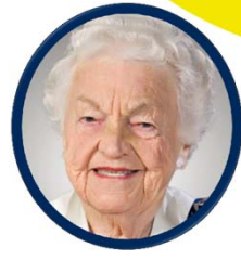
Hazel McCallion Community