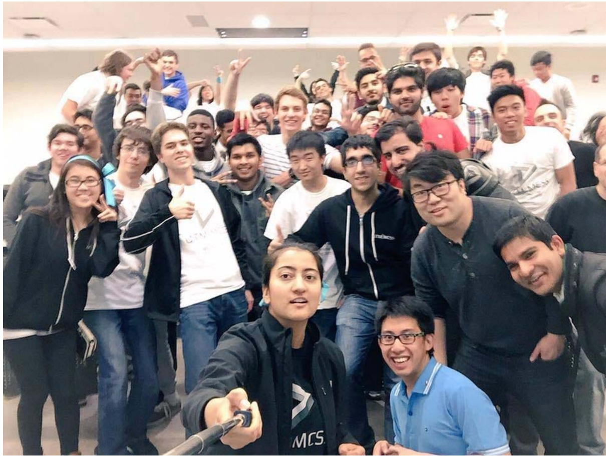
Local Hack Day