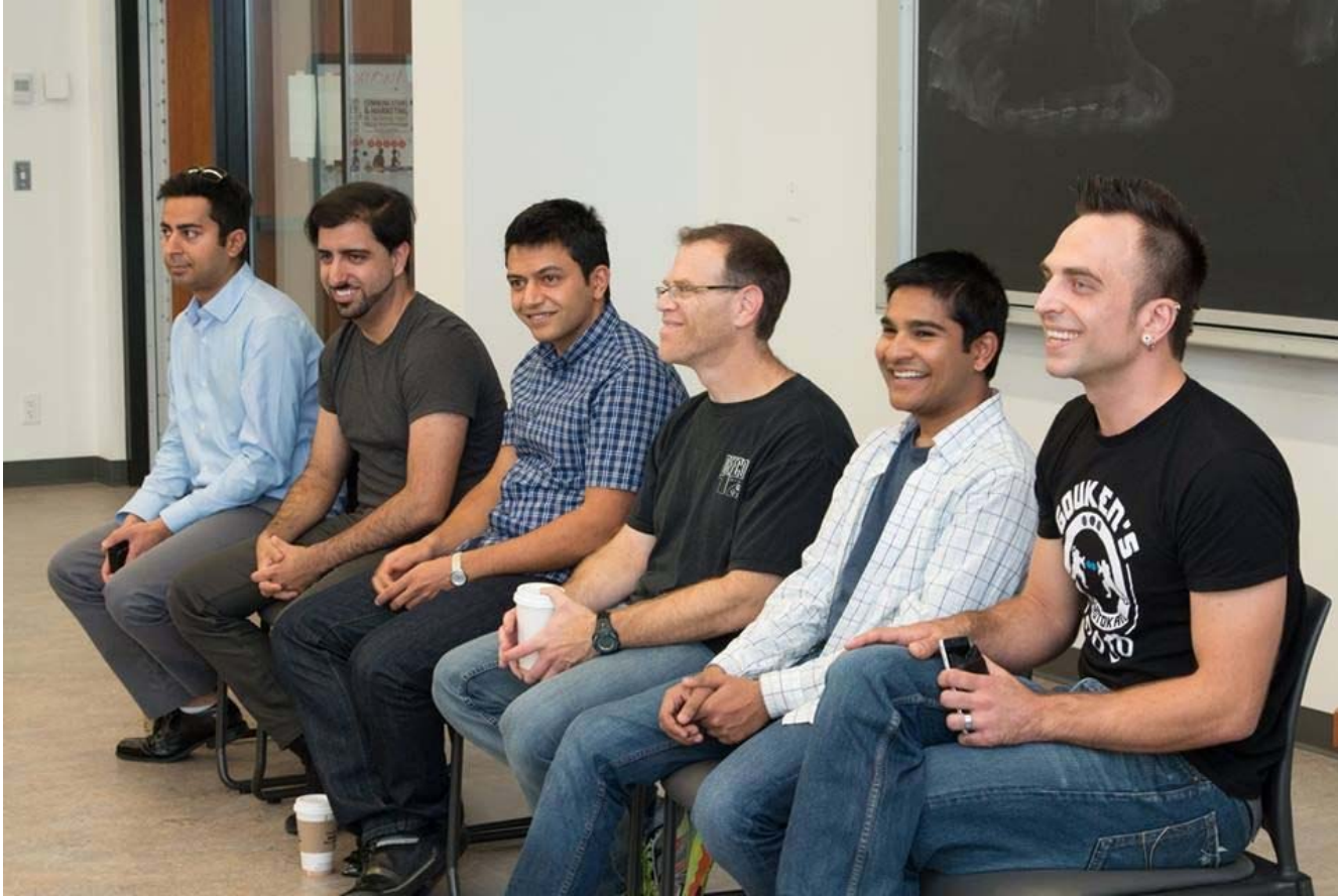
Academic Panels: PEY Night & Academic Night