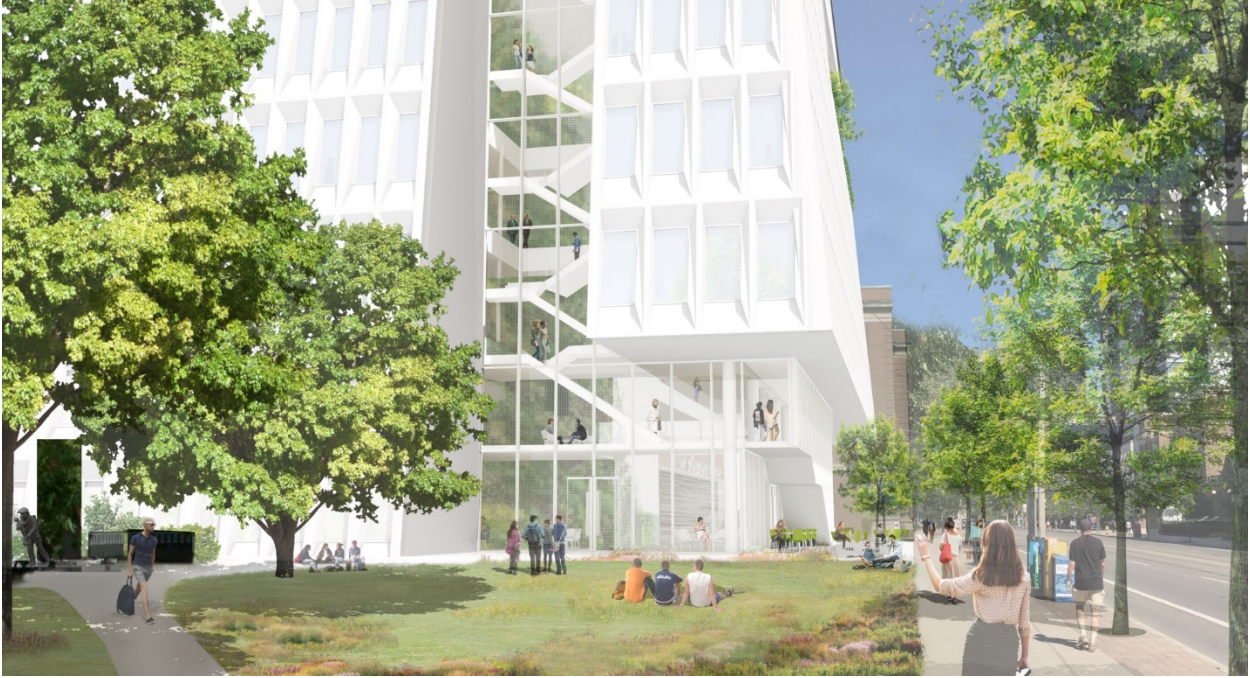
Proposed PIE Complex Phase 1, view from Queen's Park Subway, looking east.