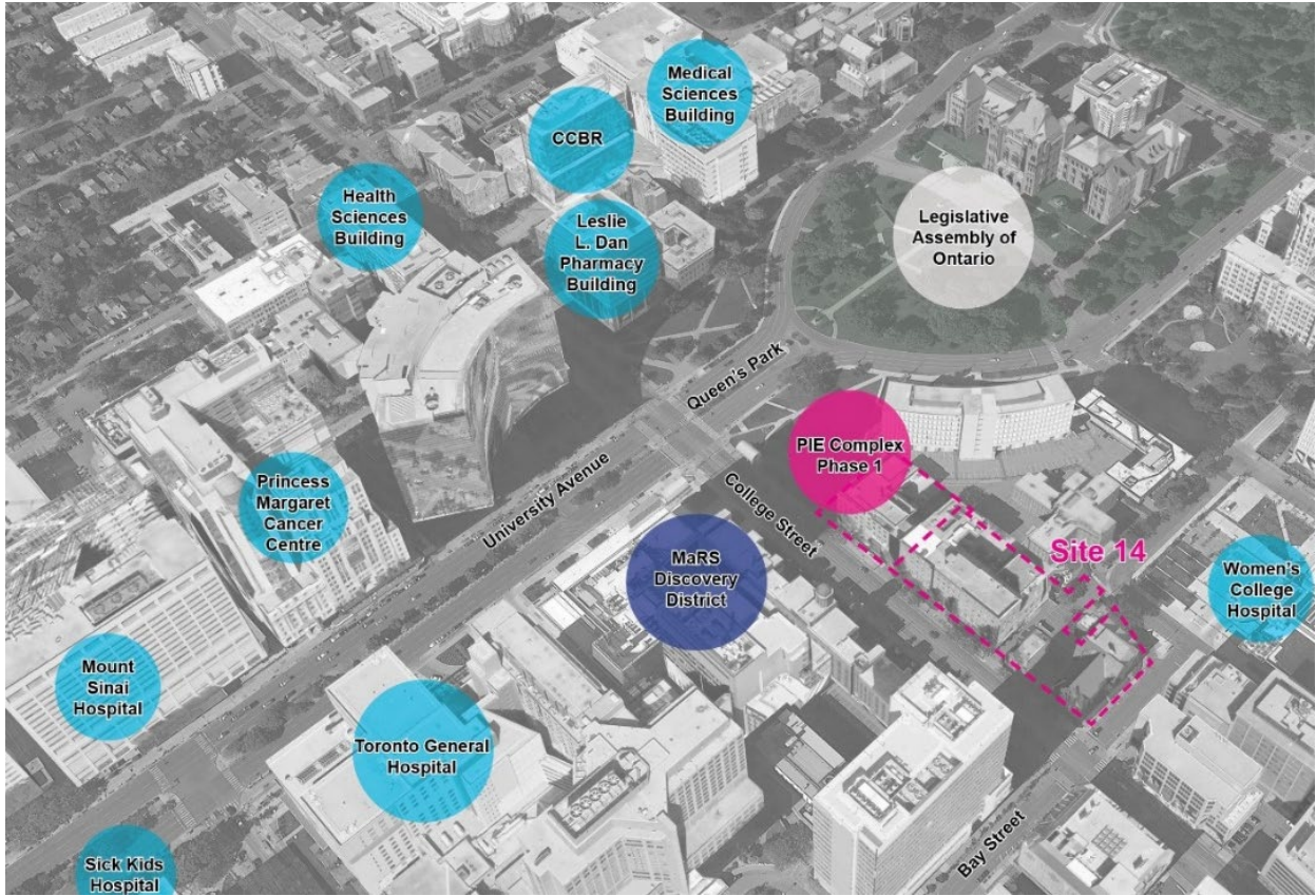
Aerial Photograph of the Discovery District, Legislature Buildings and southeast corner of St George Campus