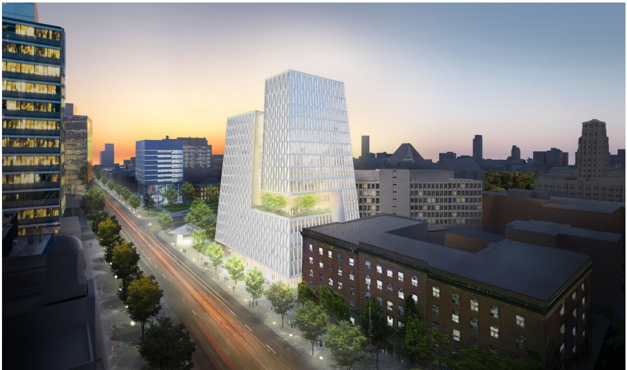
Proposed PIE Complex Phase 1, view looking west.