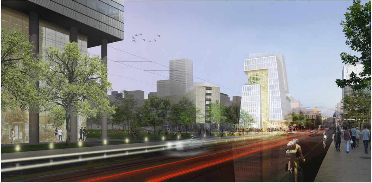
Proposed PIE Complex Phase 1, view looking east.