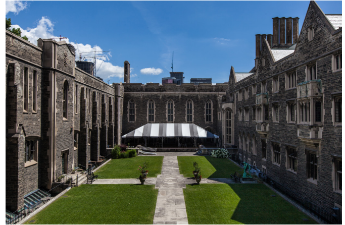
Hart House quad

It is important that our buildings and public spaces are safe and accessible to all members of the University community. While we are pleased to be able to report that the University is meeting its regulatory requirements under the Design of Public Spaces Standards and others, we also strive to increasingly incorporate accessibility into building design and operations. Examples of this work include the continued design work of the Landmark Project , with the goal of revitalizing the major public spaces of the historic St. George campus; the continuing renovations across St. George to improve accessibility on campus; the ongoing work of the Advisory Committee on Physical Accessibility at UTSC (including the retrofitting of washrooms), and; the upgrades taking place at Hart House (see Key Focus below).