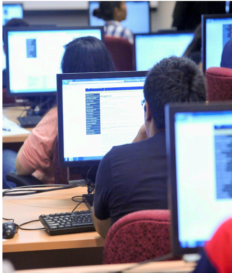
Students at Computers

Making our online spaces accessible is another important aspect of ensuring our information and communications reaches as many members of the University community as possible. This year the AODA Office, as well as communicators across our campuses, have worked to continue to address barriers to web accessibility. This has included the AODA Officer assisting in incorporating a session on accessible communications at TechKnowFile , a free technology conference offered to all faculty and staff, the AODA Office delivering regular accessible communications workshops on all three campuses, the AODA Office's WCAG 2.0 project (see Key Focus below), and Arts & Science developing an AODA Compliance Guidebook, an all-in-one tool to assist with Information & Instructional Technology applications. In addition to these projects, the Inclusive Design Research Centre were brought in to provide in depth training to web developers, designers and writers, through the University's Organizational Development & Learning Centre (ODLC). Finally, New College's D.G. Ivey Library created a new role of Accessibility & Public Services Librarian whose role is to work on improving the level of accessibility and AODA compliance of the services offered