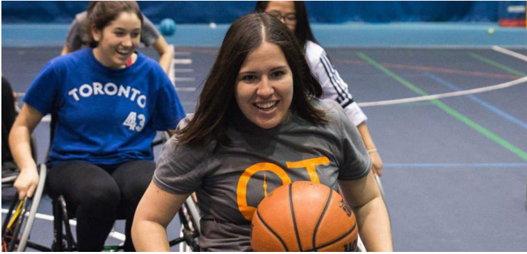
Students playing wheelchair basketball

This year the University has participated in a number of meaningful projects with various external partners to develop innovation solutions for accessibility, including: Play the Game ; U of T startups winning awards at the Ontario Centres of Excellence Discovery Conference , a UTSC project to make labs more accessible , and the University's Strategic Recruitment Centre's participation in the Dolphin Mentoring Day (Key Focus below).