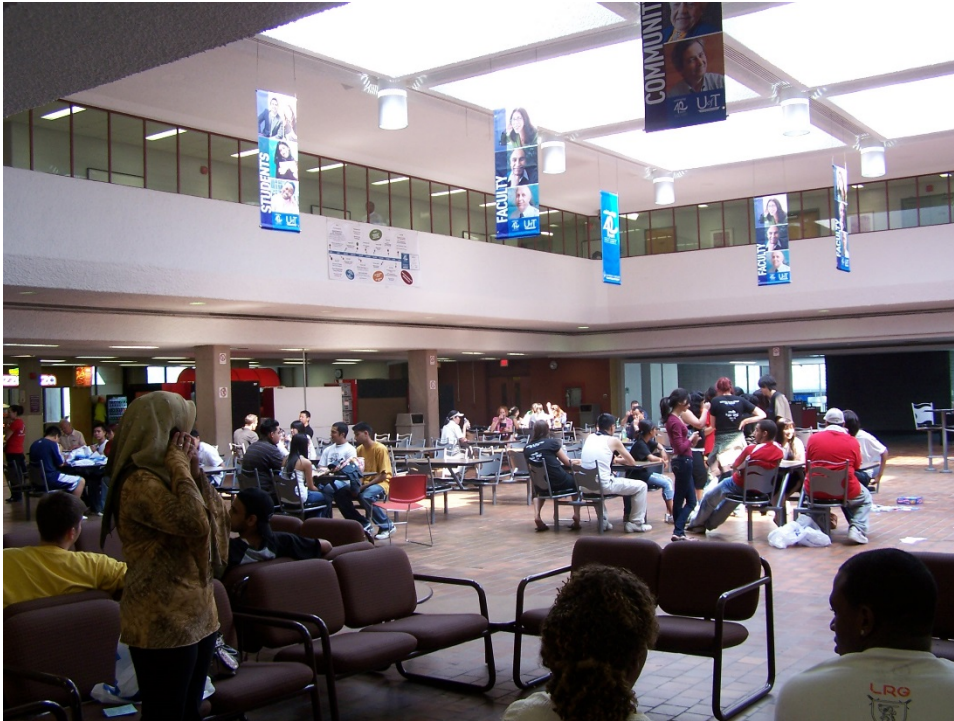
The Meeting Place

Currently, the main floor (Level 2) of this wing of the Davis Building is divided into two sections: the double-height sky-light Meeting Place and the Temporary Food Court (TFC). The Meeting Place contains seating for 200 people, a full-service Tim Hortons, a temporary Subway, a bank of vending machines, and access to a (crumbling) patio. Once the Davis Building Reconstruction Project is complete, the Tim Hortons and the bank of vending machines will remain in their current locations, with the Subway outlet re-located elsewhere or included as part of the new, permanent food court.