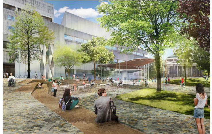
Designers rendering showing Landmark area at Medical Science Building

In addition to the goals of the AODA in the built environment, it is important that our buildings and Public Spaces are safe and accessible to the University community. Whilst the University is meeting its regulatory requirements under the Design of Public Spaces Standards and others, we also seek to meaningfully incorporate accessibility into building design and operations. Examples of this work include the accessibility designs of the Landmark Project, with the goal of revitalizing the major public spaces of the historic St. George campus (see Key focus below); the continuing renovations across St. George to improve accessibility on campus, including those at OISE; and the ongoing improvements made to the AODA Office's Building Access Notices system.