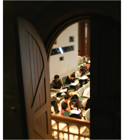
Students in University College Classroom

In recognizing there are various ways to make education more accessible, the University has worked to provide resources on how to do so. Information and advice on the incorporation of accessible course design have been widely disseminated with support provided. This is in line with AODA requirements to provide training to educators in this area and further helps to create accessible spaces. Examples of this have included: an AODA Office Tour; whereby we visited various departments and faculties to discuss accessible course design; workshops provided to faculty by both the Teaching Assistant Training Program (TATP) and the Centre for Teaching Support & Innovation on accessible teaching practices; resources provided to TAs on fostering accessible learning environments (see Key Focus below); and the working of the Online Learning Strategic portfolio to provide resources on designing interactive learning objects like Articulate Storyline. This year as part of the Learning Portal renewal process, consultation on its accessibility took place, including a testing session at the Students for Barrier-free Access Computer lab.