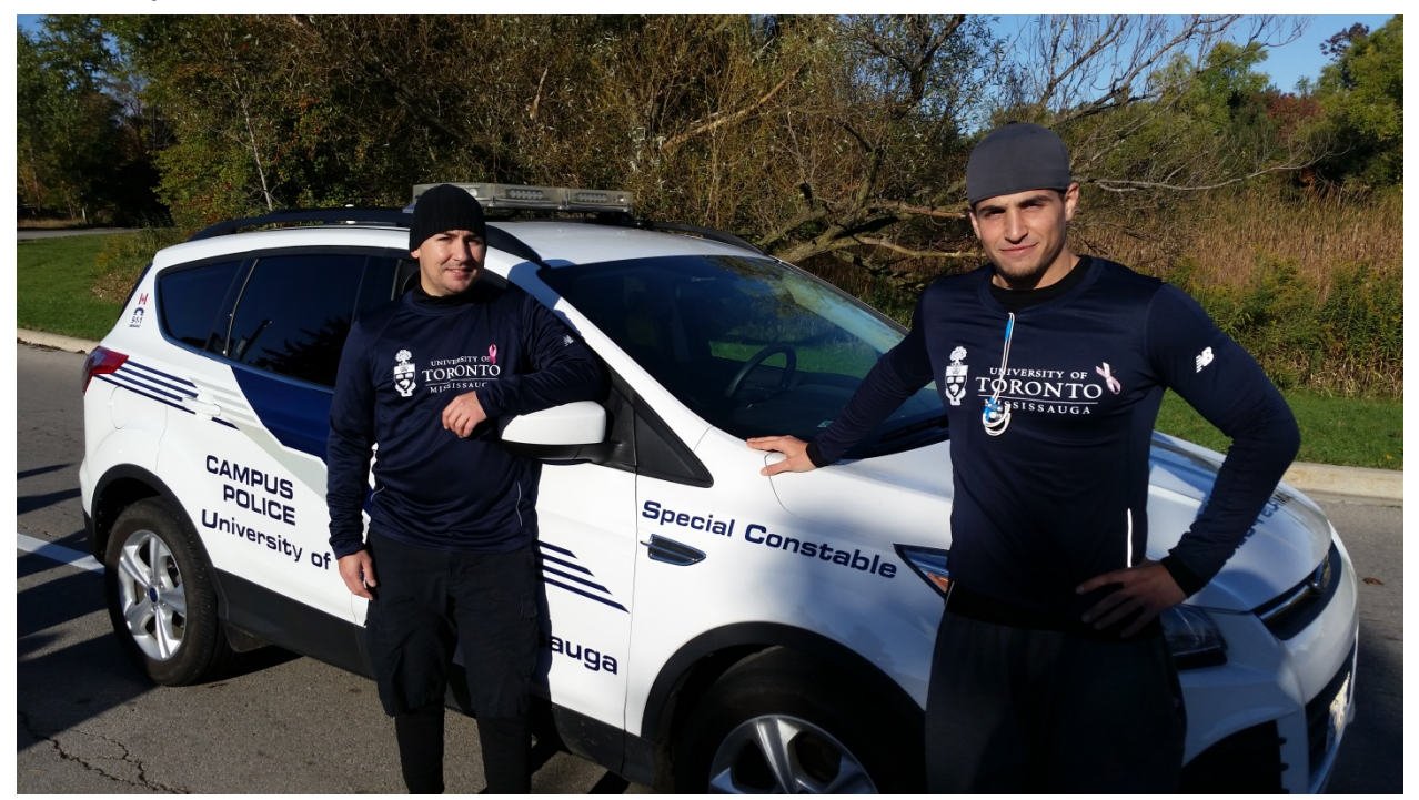
How Many Officers Does It Take To Run In The CIBC Run For The Cure At UTM?

Apparently two! And we are proud of them both.