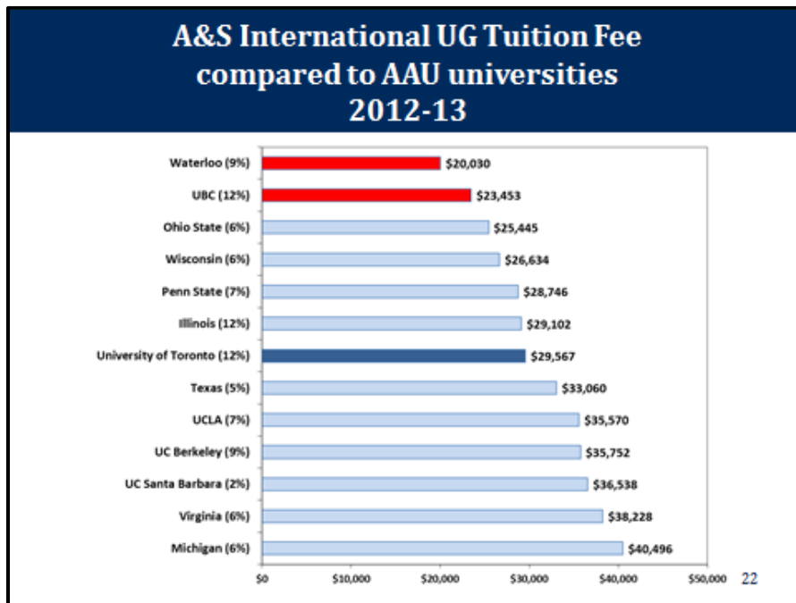
Figure 3: International tuition fee for Arts & Science at the University of Toronto, relative to some AAU peers, for 2012-13.

International tuition fees at the University of Toronto remain competitive with peer institutions. Once again, a comparison of the Arts and Science undergraduate tuition is a useful example. Arts and Science international undergraduate tuition (plus incidental fees) at the University of Toronto ($29,567) is at the top of the range of our U15 peers. This is appropriate given the University of Toronto's place in the international rankings. Tuition plus fees for undergraduate out-of-state Arts and Science students for the AAU public universities in the United States ranged last year from $18,609 to $40,496 US, with a mean of $28,653. Private institutions' fees remain considerably higher at $37,500 to $43,200. Applications from international students across all programs remain very strong, and in fact are increasing each year. Figure 3 displays the international tuition fee for Arts & Science at the University of Toronto, relative to some AAU peers, for 2012-13.