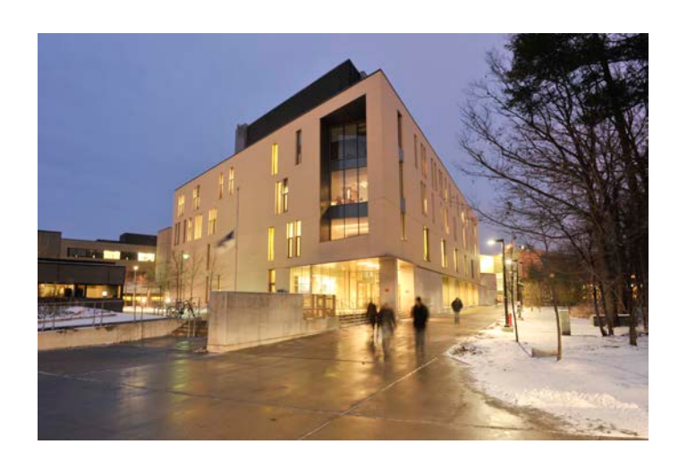
February 11, 2015

Prepared by the University of Toronto Planning and Budget Office