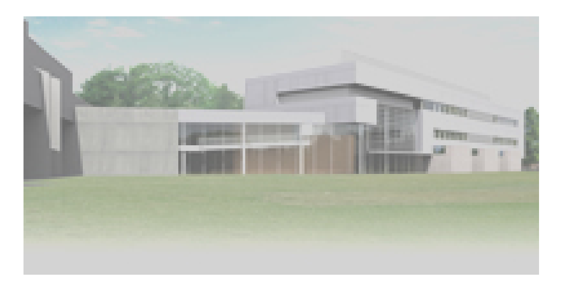
UTSC - Science Building