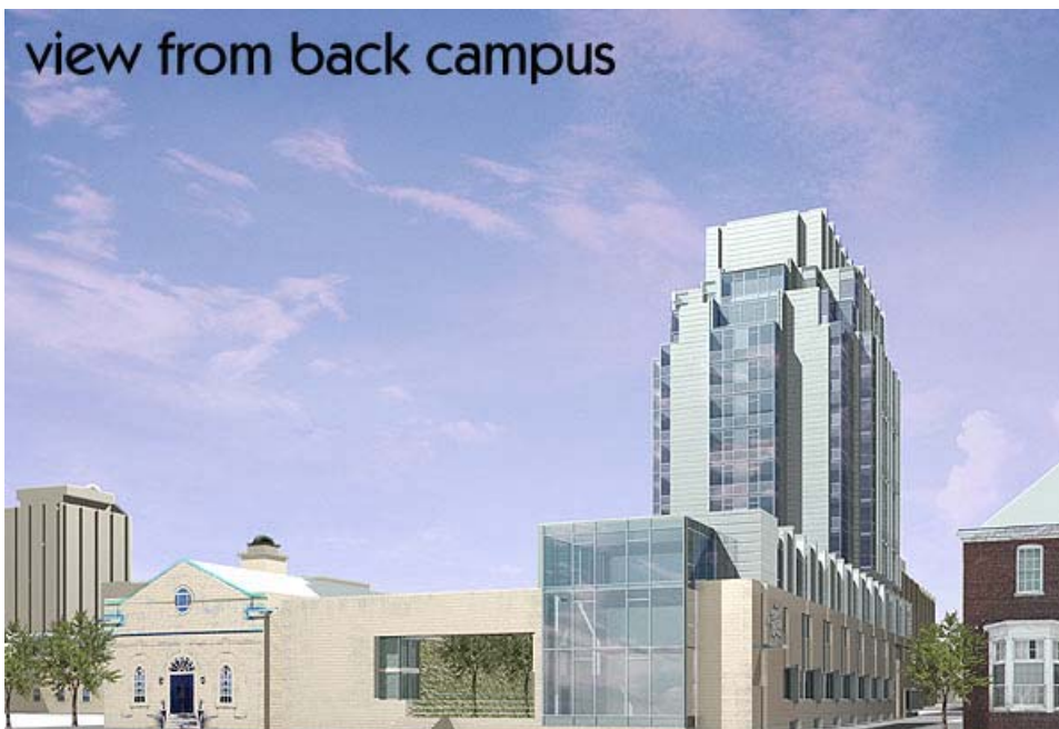
Sector 8: Residences University College Residence