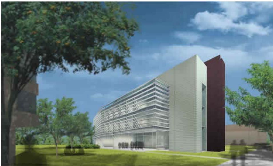
Sector 1: University of Toronto at Scarborough Management Building