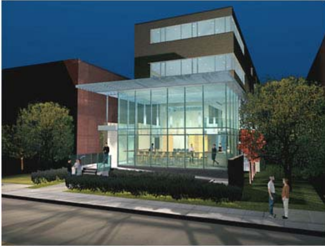
Sector 7: Campus School of Continuing Studies