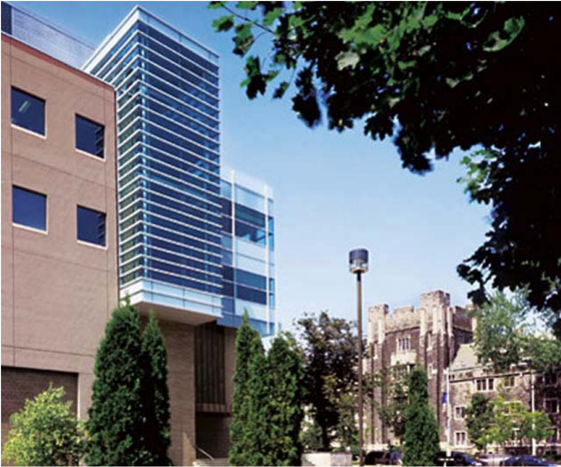
Sector 4: Faculty of Arts and Science Lash Miller Undergraduate Laboratories