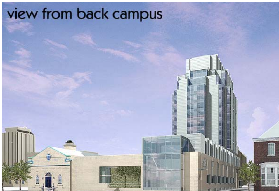
Sector 8: Residences University College Residence