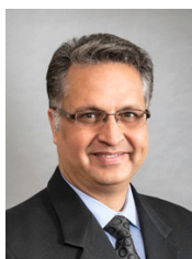
Anwar Kazimi Deputy Secretary of the Governing Council