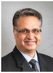
Anwar Kazimi Deputy Secretary of the Governing Council