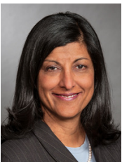
Zabeen Hirji Government Appointee