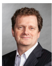
W. Keith Thomas Alumni