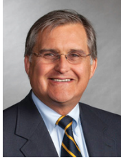
Harvey Botting Alumni