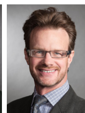
Mark Henry Rowswell Government Appointee