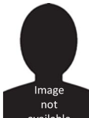
TBA Dean and Vice Principal (Academic), UTSC