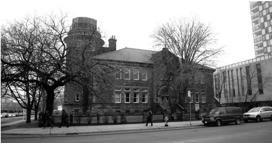
Building as seen from Bloor Street today (2009)

The existing main building has accommodated approximately 960 net assignable square metres in its current configuration of offices and related support space. The total gross area is approximately 1,640 square metres (including basement and mechanical spaces).