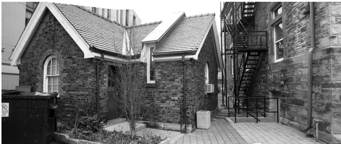
Registrar's office/Transit House, located on the west side of main building (2009)

office activities. This small building could also be converted into student study space, meeting or support space for the School.