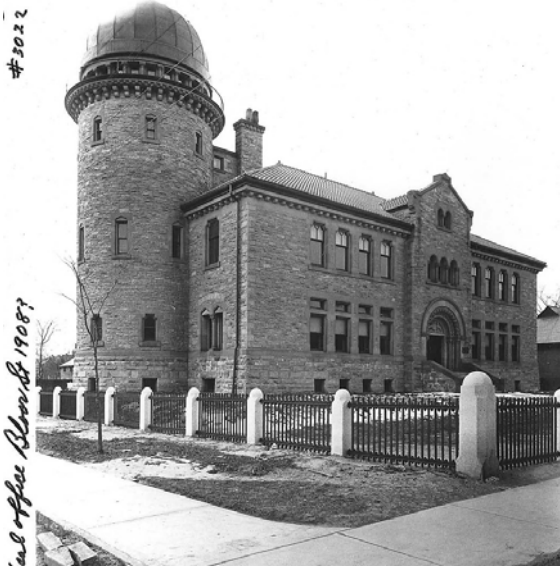
Building soon after completion (1908)

The main building at 315 Bloor Street West, originally named the Toronto Observatory, was designed by Burke and Horwood Architects and constructed in 1907. The building was originally a meteorological observation centre and operated as such well into the latter half of the 20 th century, when it was then converted for office use. It was added to the City of Toronto's Heritage Properties Inventory in 1973.